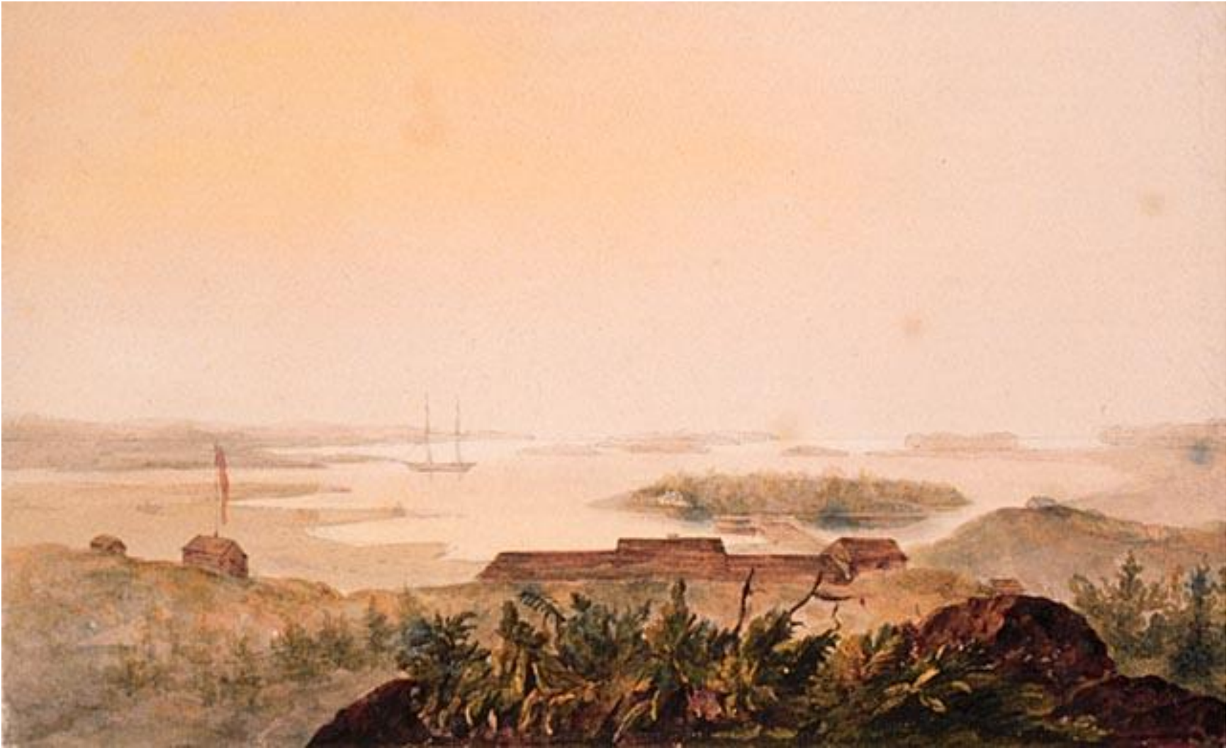
Drummond's Island, Lake Huron