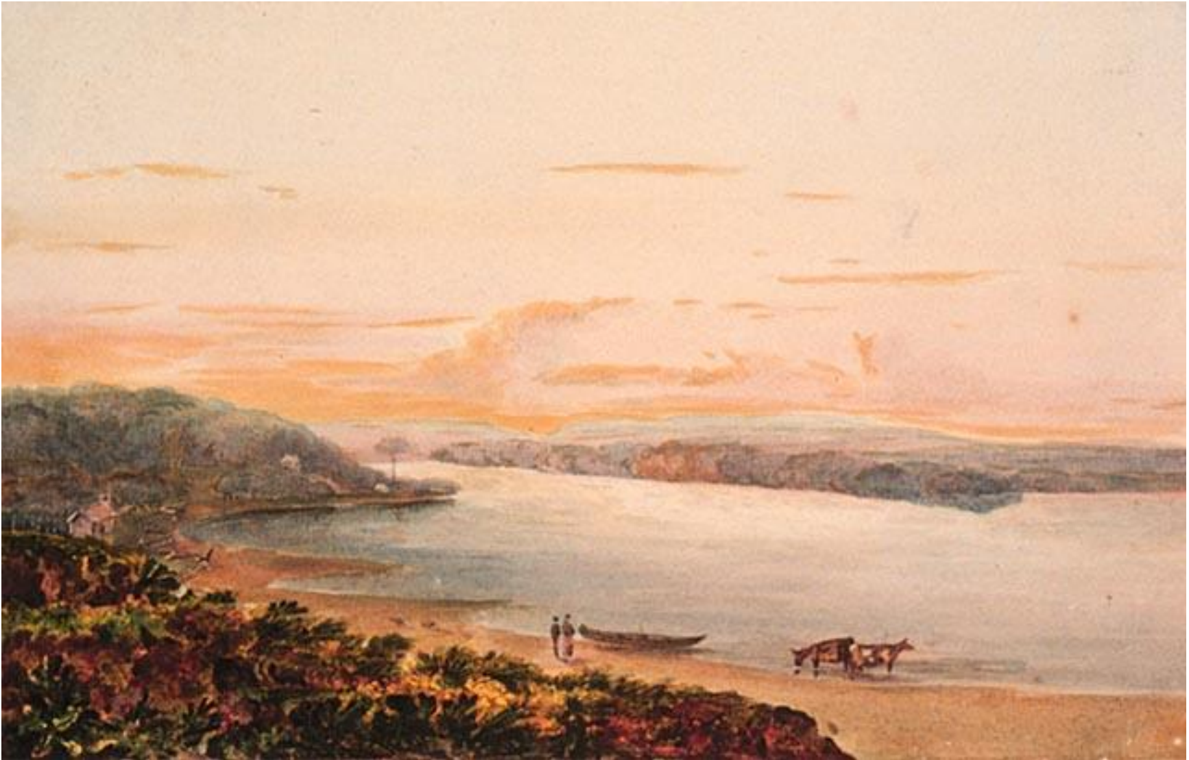
Falls of St. Mary's, Lake Superior, American Side Sault-Sainte-Marie