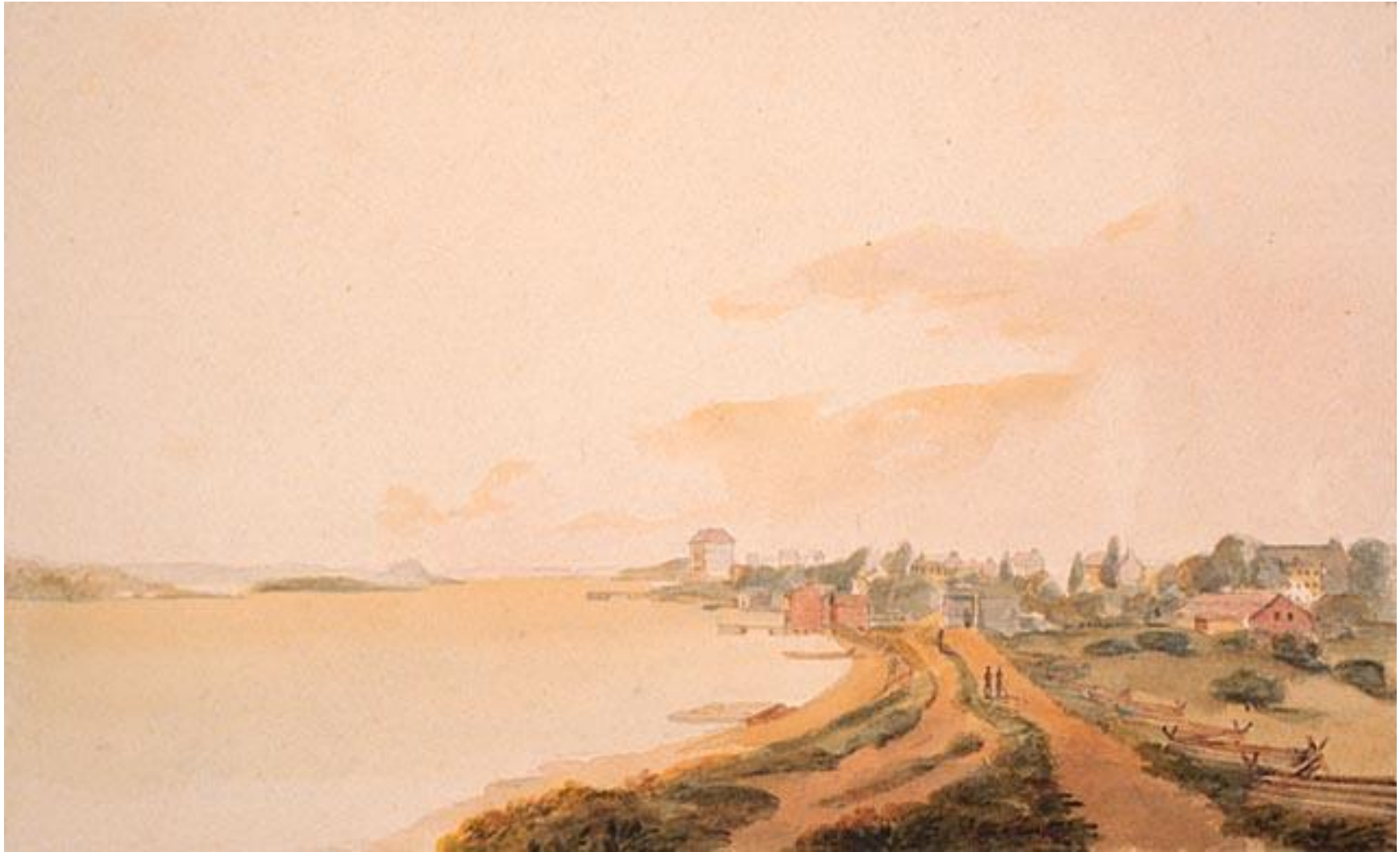
Amherstburg, Looking up the River Amherstburg