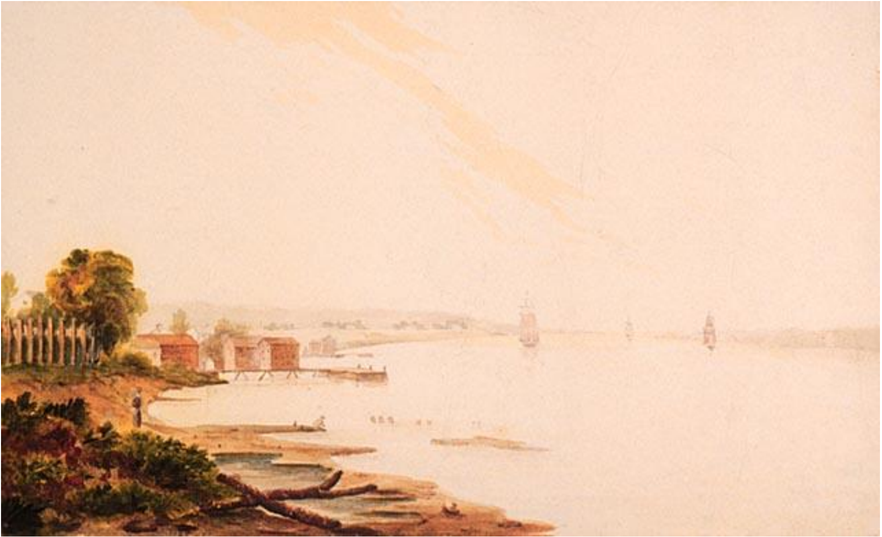
Amherstburg, Looking down the River Amherstburg