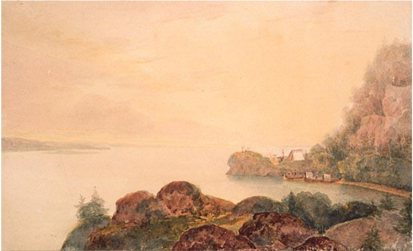
Gros Cap, Lake Superior