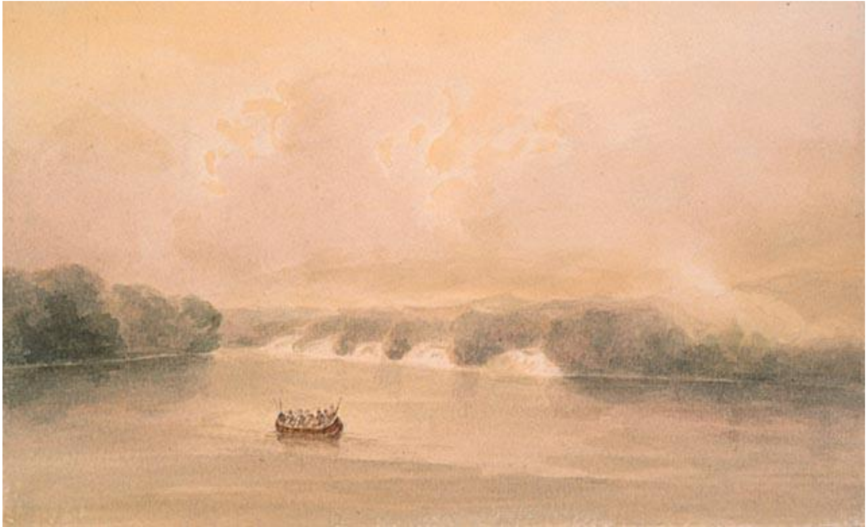
Falls au Chat on the Ottawa