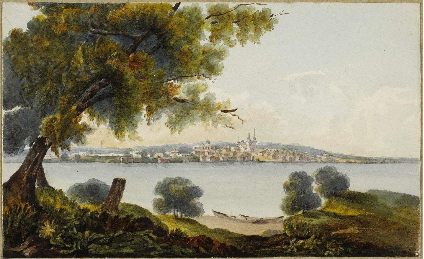
City of Detroit, Michigan