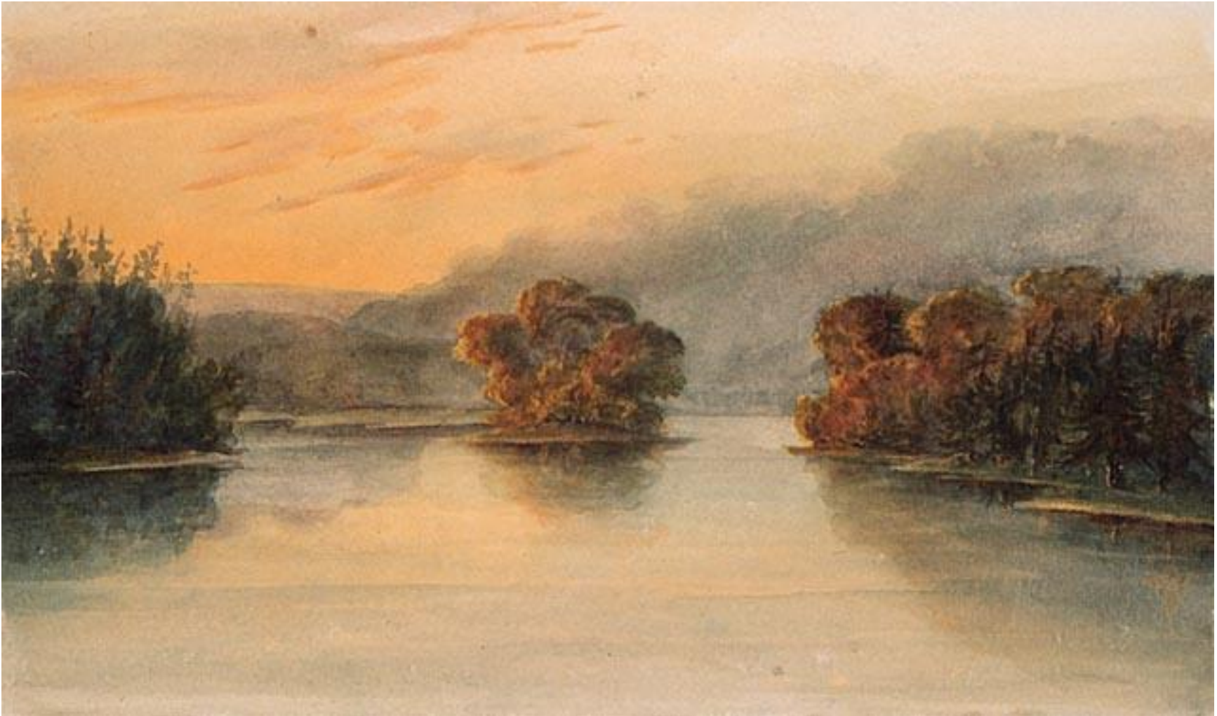
Petite Rivière Joins Ottawa near Lake Nipissing