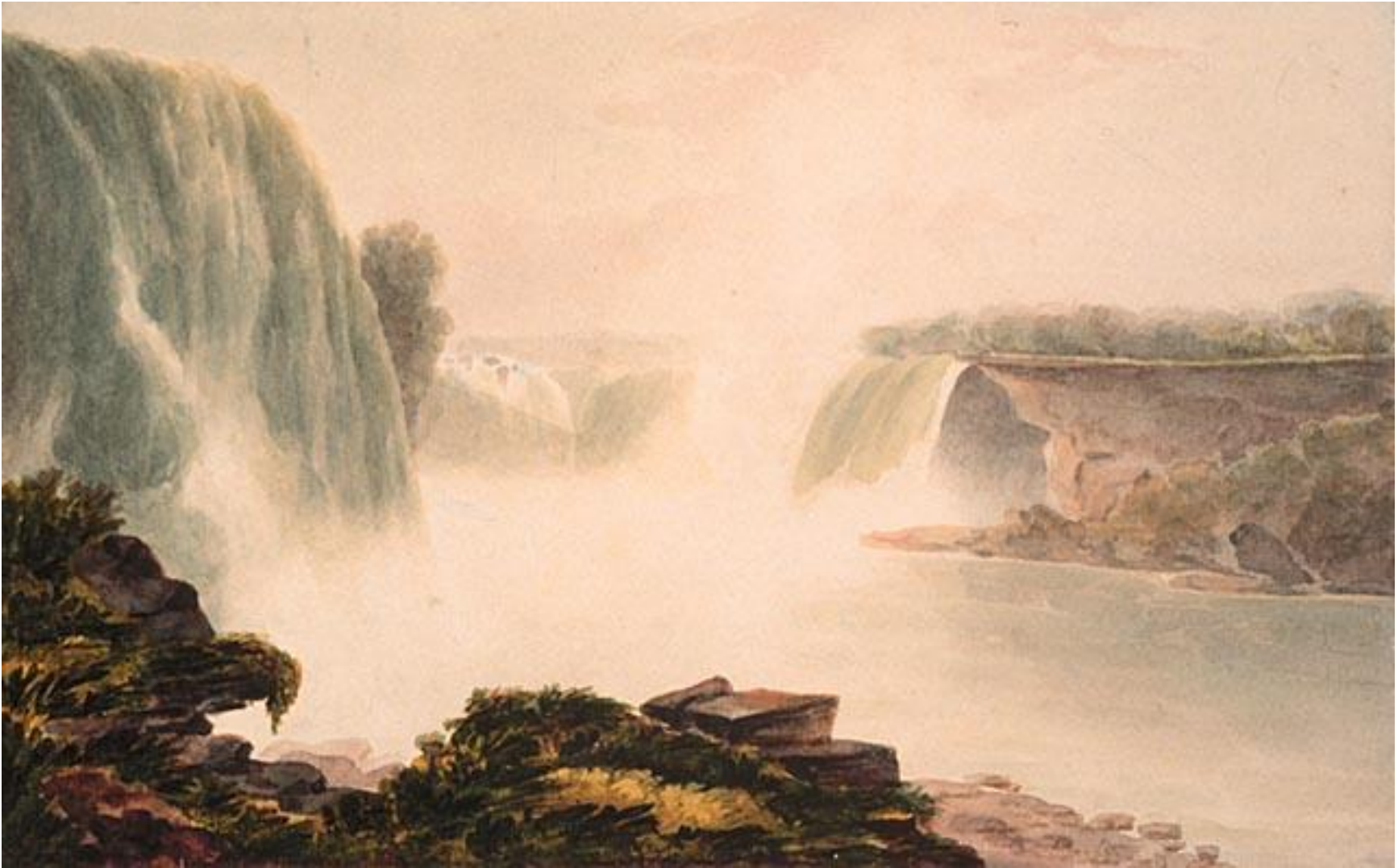
Falls of Niagara, at Foot of the American Side