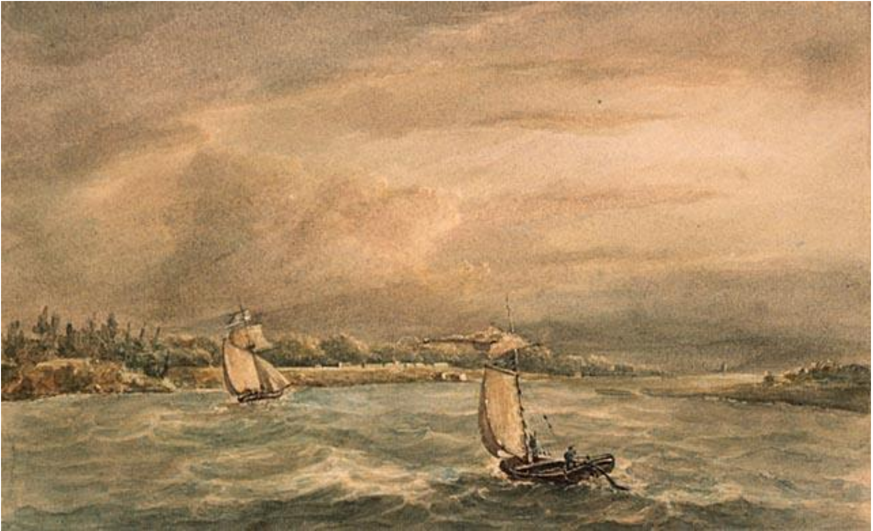
Fort Gratiot, St. Clair River