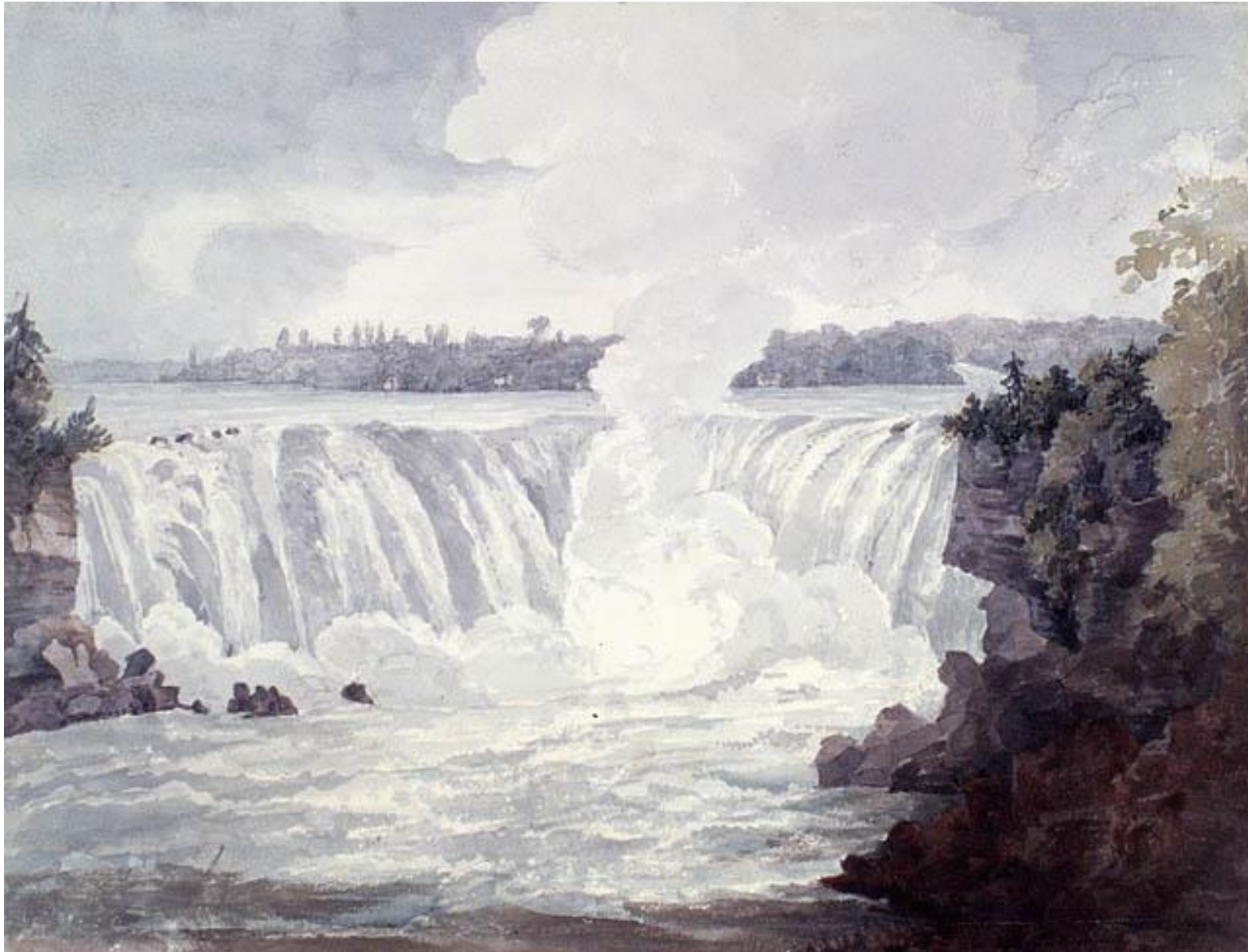
Elizabeth Posthuma Gwillim Simcoe – Niagara Falls, Upper Canada – Mikan # 2834113 – Acc. No. 1938-223-34