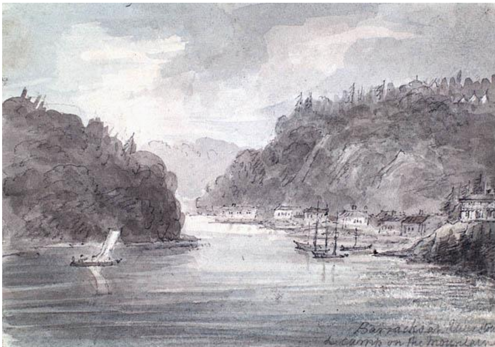
Elizabeth Posthuma Gwillim Simcoe – June-July, 1793 ? – Barracks at Queenston and Camp on the Mountain – Mikan # 2833214 - Acc. No. 1938-223-26