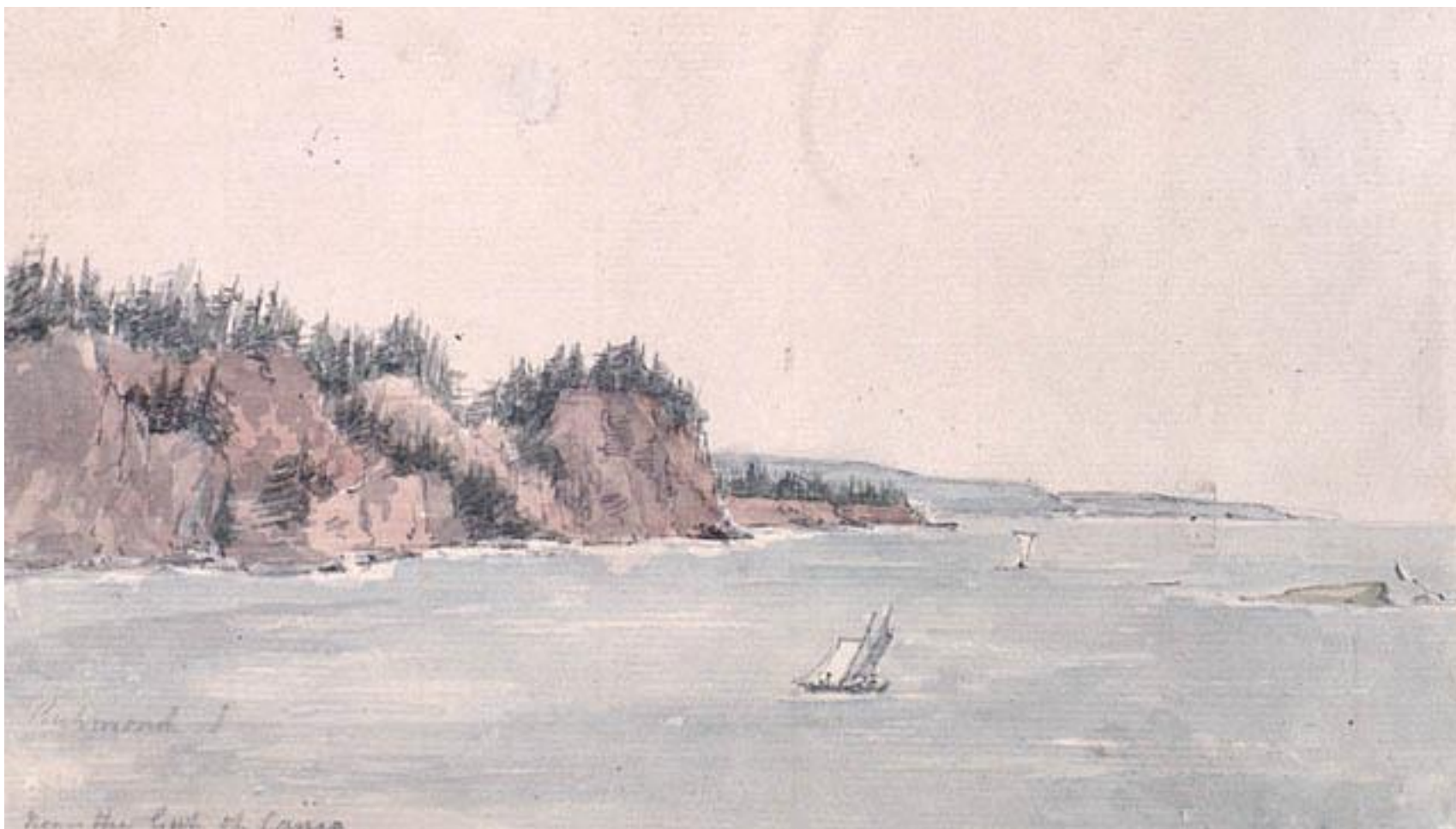
Elizabeth Posthuma Gwillim Simcoe – October 29, 1791 – Richmond Island (Isle Madame) and Green Island near the Strait of Canso – Mikan # 2834104 – Acc. No. 1938-223-1