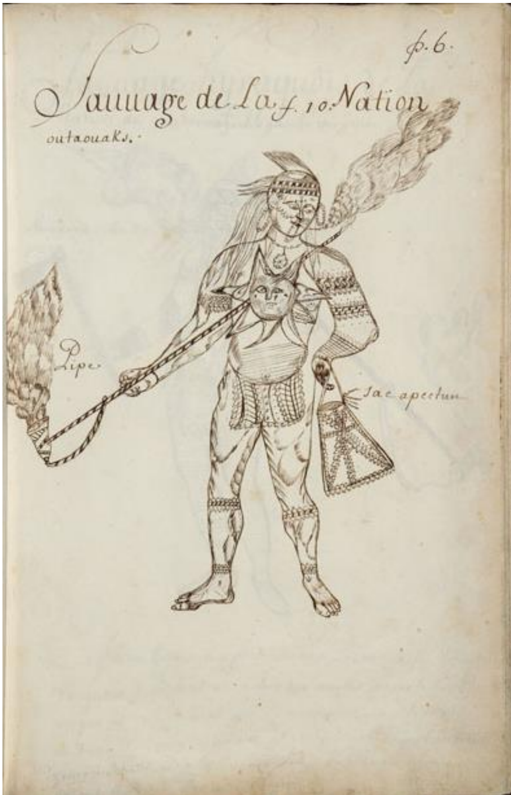
An Ottawa/Odawa with a pipe and tobacco bag