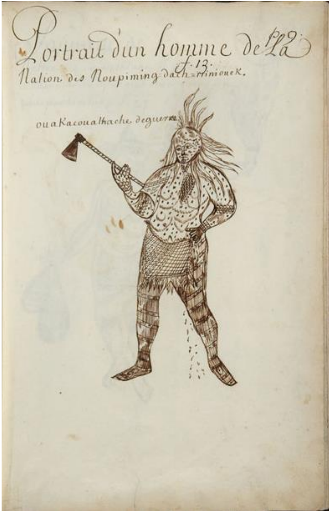
Noupiming-dach-iriniouek or the Attikamek (a Nation that spoke the Cree language) carrying a war axe