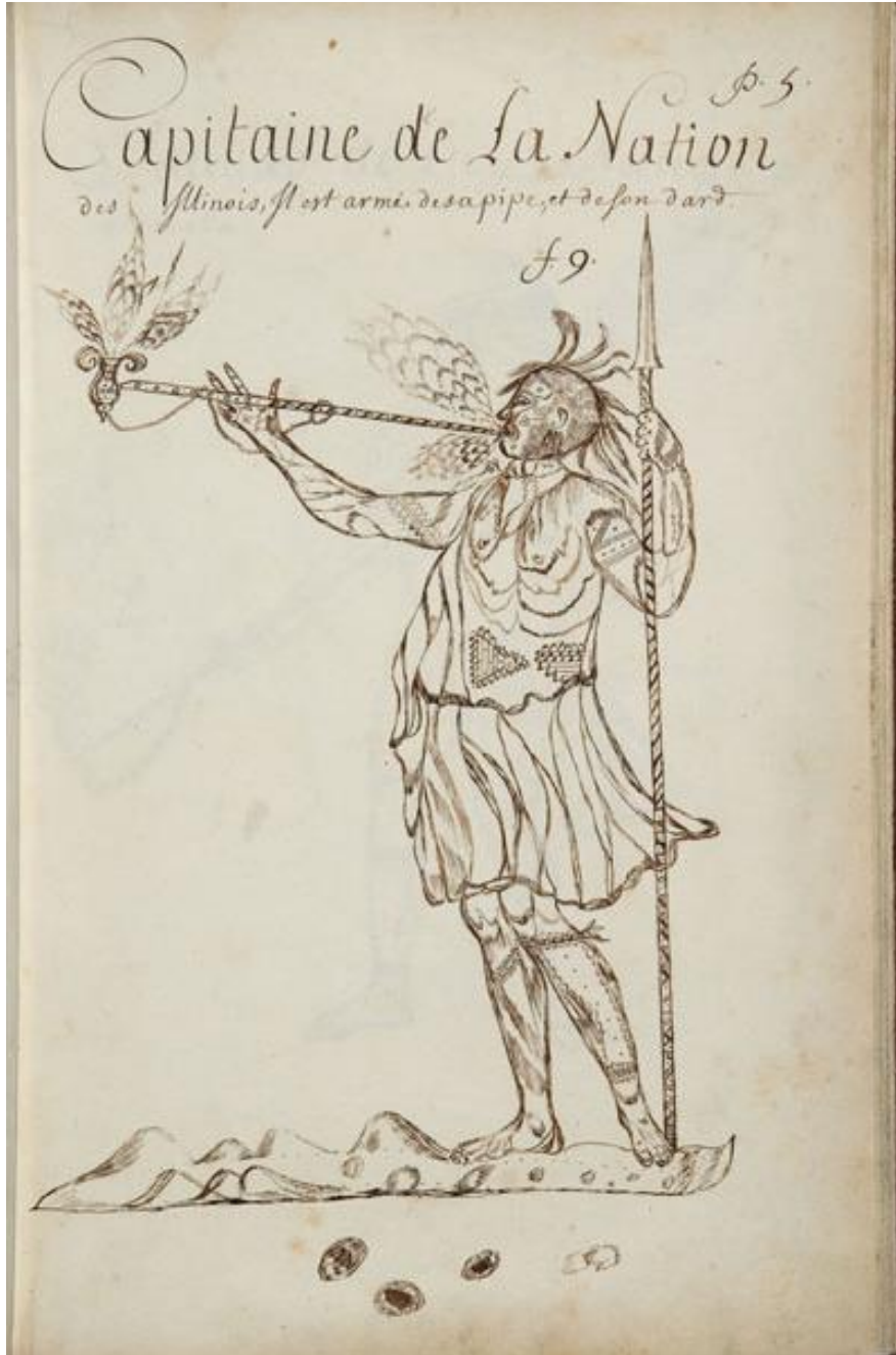
Captain of the Illinois Nation, carrying a pipe and spear