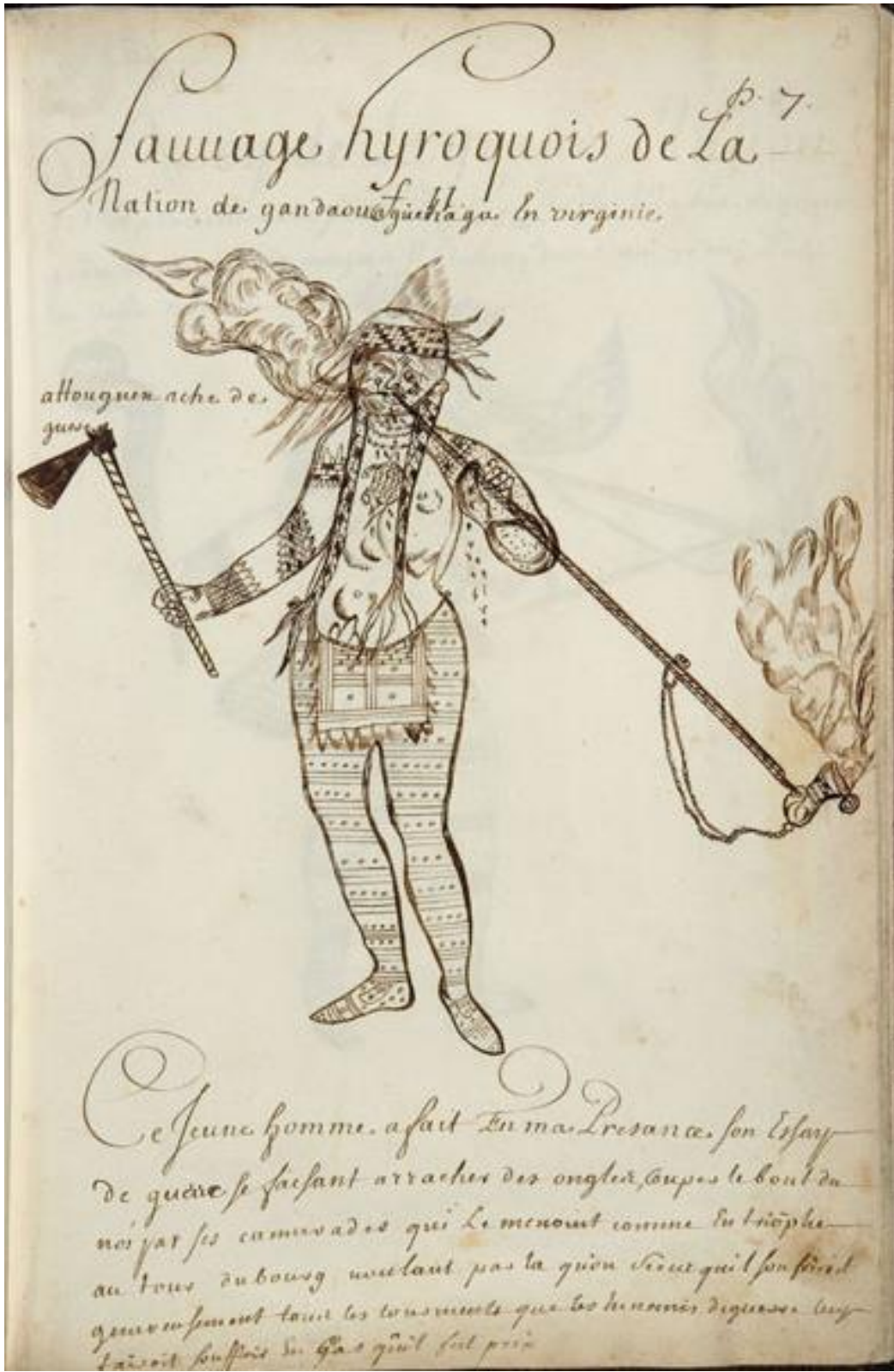
An Iroquois carrying a pipe and war club