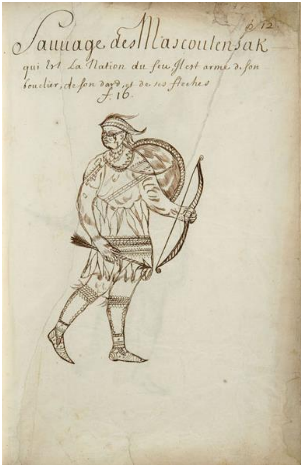
A Mascoutin equipped with his shield, spear, and arrows