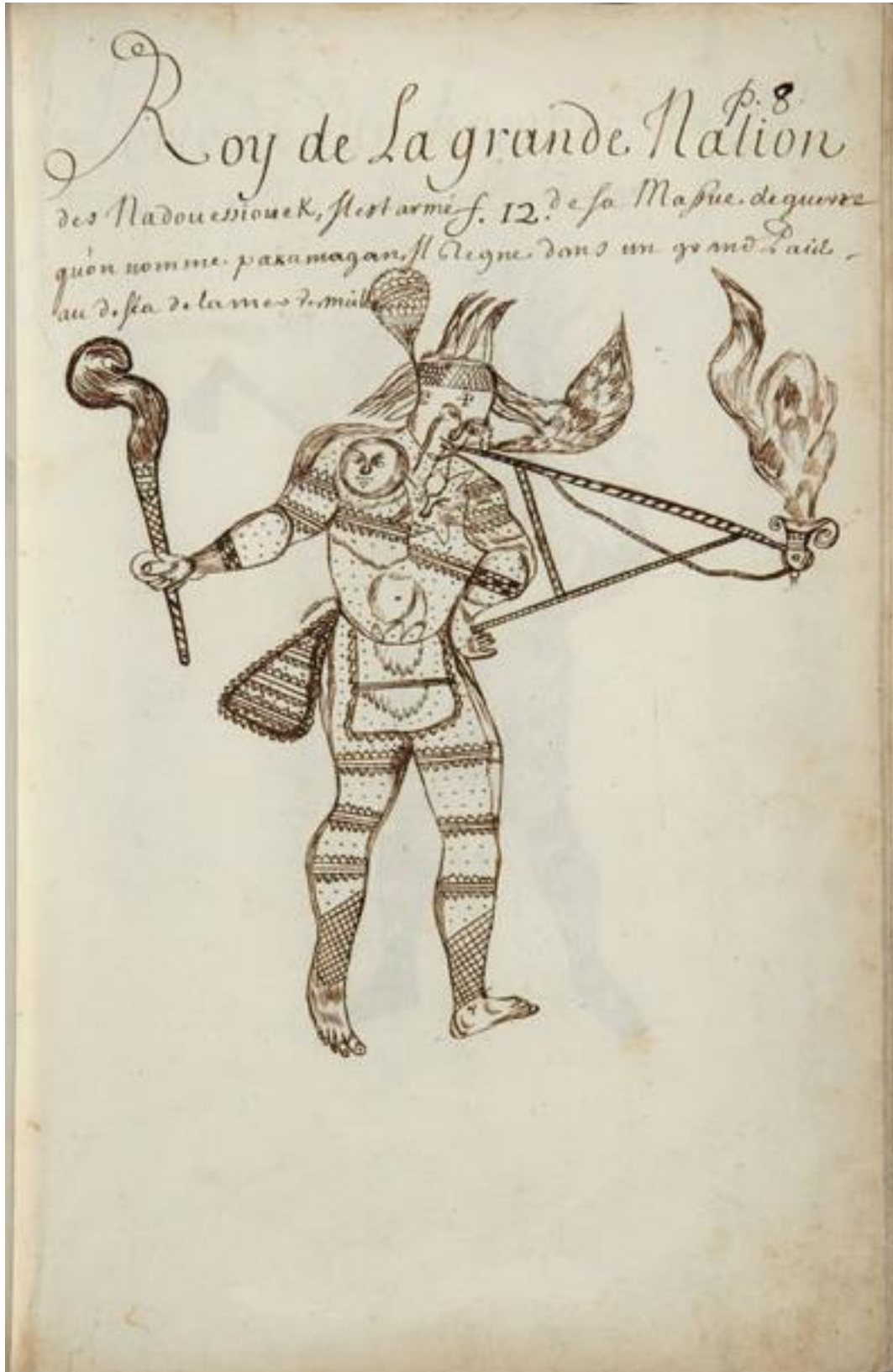
A Sioux "King" with a pipe and tobacco bag, armed with a war club