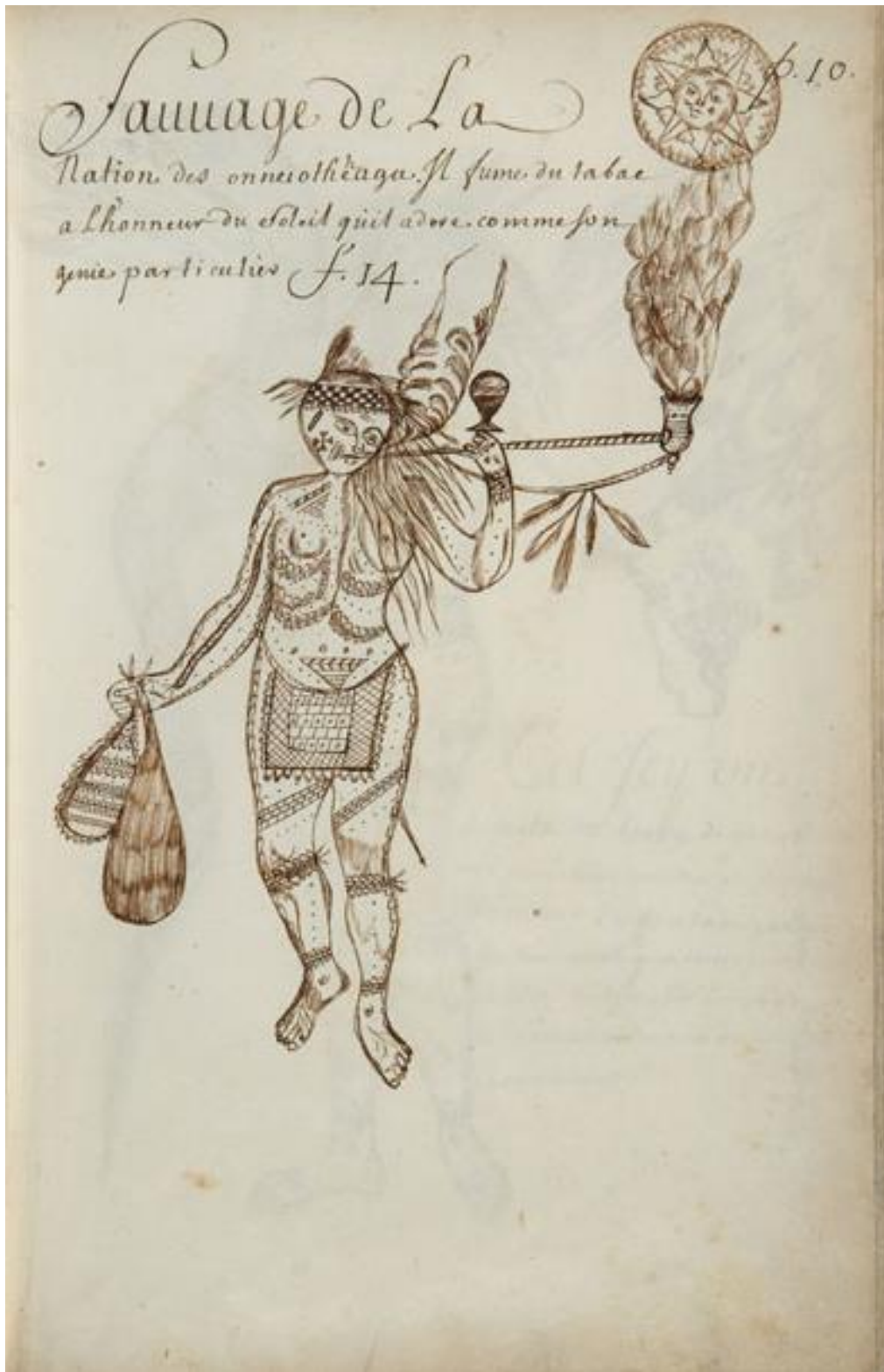
An Onniethéaga (probably an Oneida) smoking tobacco in honor of the Sun which he worships as his personal spirit