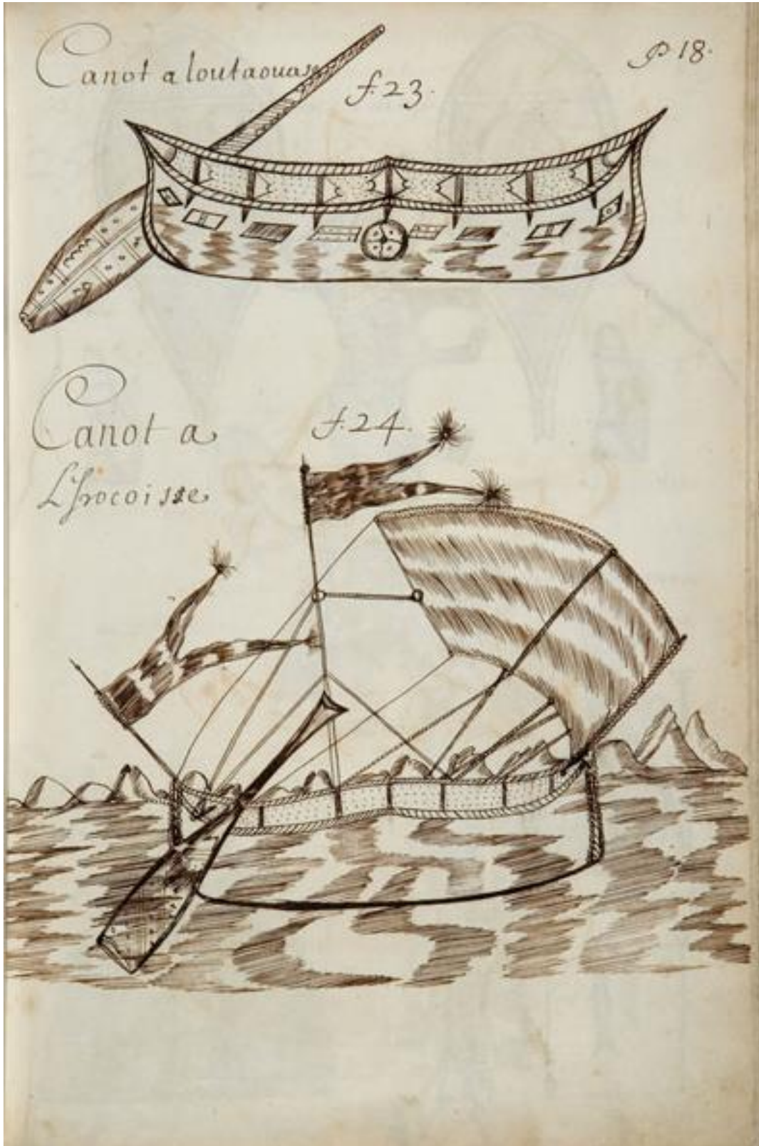
An Ottawa/Odawa canoe and an Iroquois canoe