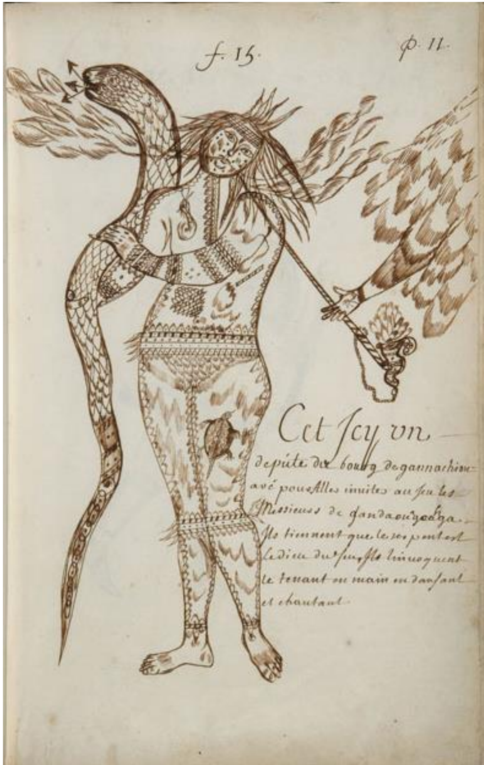
This is an illustration of a representative sent by the village of Gannachiou-aé to invite the men from the village of Gandaouagoahga to a game. These Indians believe that the snake is the god of fire. They invoke the god by holding the snake in their hands while they dance and sing.