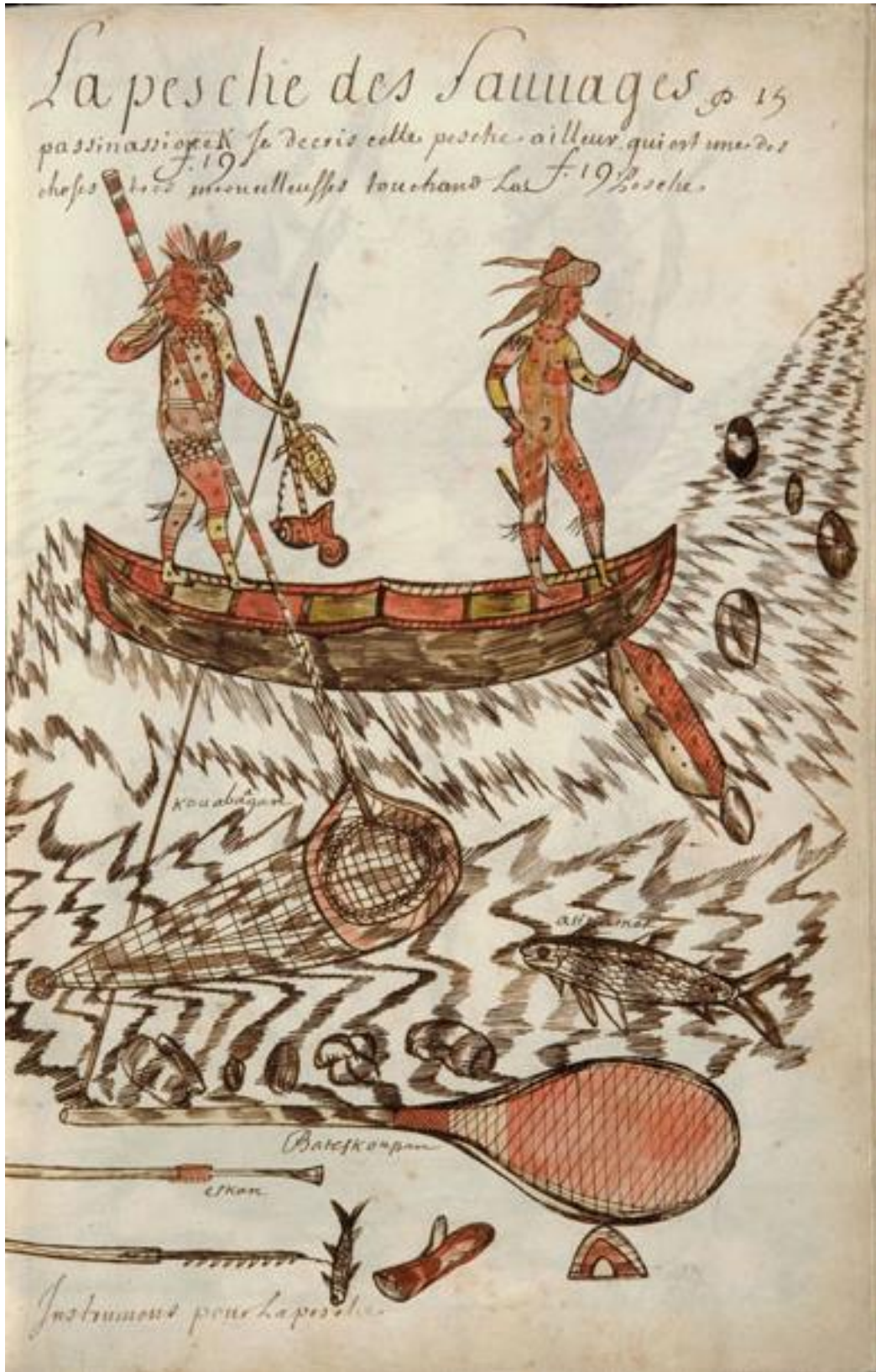
Illustration of Native Americans fishing from a canoe