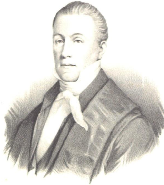
L' H BLE JACQUES BABY. Archives de Montréal

The Honorable Jacques Baby (Archives de Montréal)