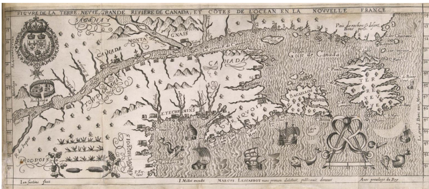
Marc Lescarbot, 1609 Map Figure de la Terre Neuve, Grande Rivière de Canada, et côtes de l'Océan en la Nouvelle France – Available from Bibliothèque et Archives nationales du Québec BANQ , http://www.banq.qc.ca/collections/cartes_plans/index.html

Marc Lescarbot was a lawyer and author who accompanied Jean de Biencourt de Poutrincourt and Pierre du Gua de Monts to Acadia in 1606 and 1607. After his return to France, he wrote a three-volume History of New France. These books were translated into English and published by the Champlain Society, starting in 1907. 1