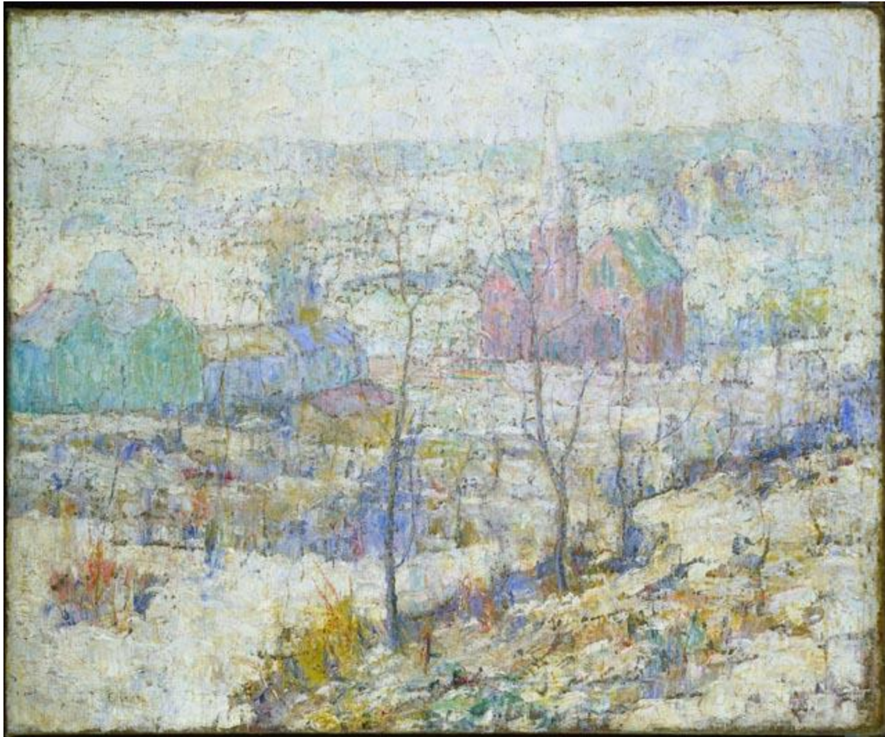
Winter , Available from Artefacts Canada

Ernest Lawson Diane Wolford Sheppard © 2014 – All Rights Reserved