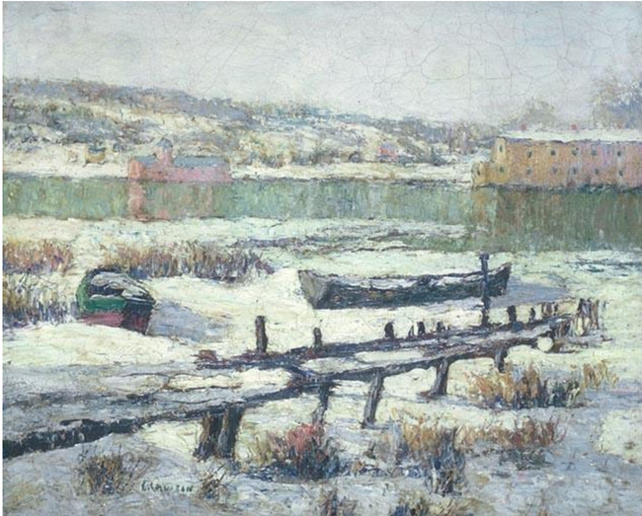
Snowbound Boats , Available from Artefacts Canada

Ernest Lawson Diane Wolford Sheppard © 2014 – All Rights Reserved