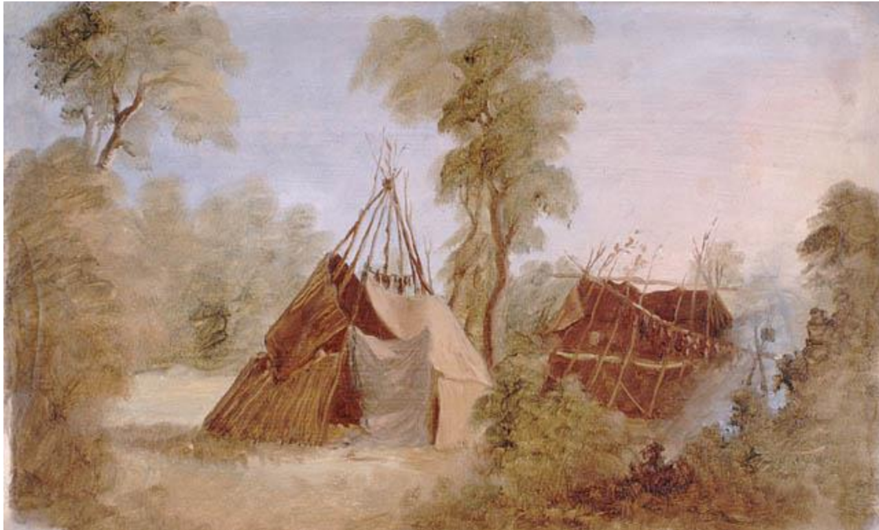
Ojibway Camp, Spider Islands, Lake Huron, 1845, Mikan # 2836747

Paul Kane