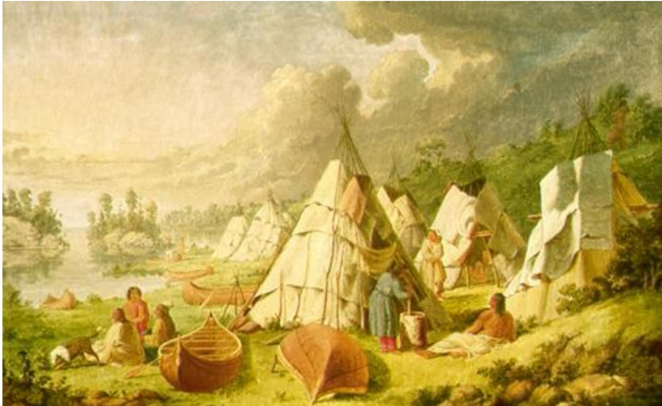
Indian Encampment on Lake Huron , courtesy of Wikipedia.org.

Paul Kane