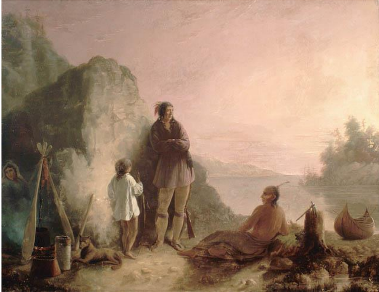
Indian Encampment at Georgian Bay, circa 1850

Paul Kane