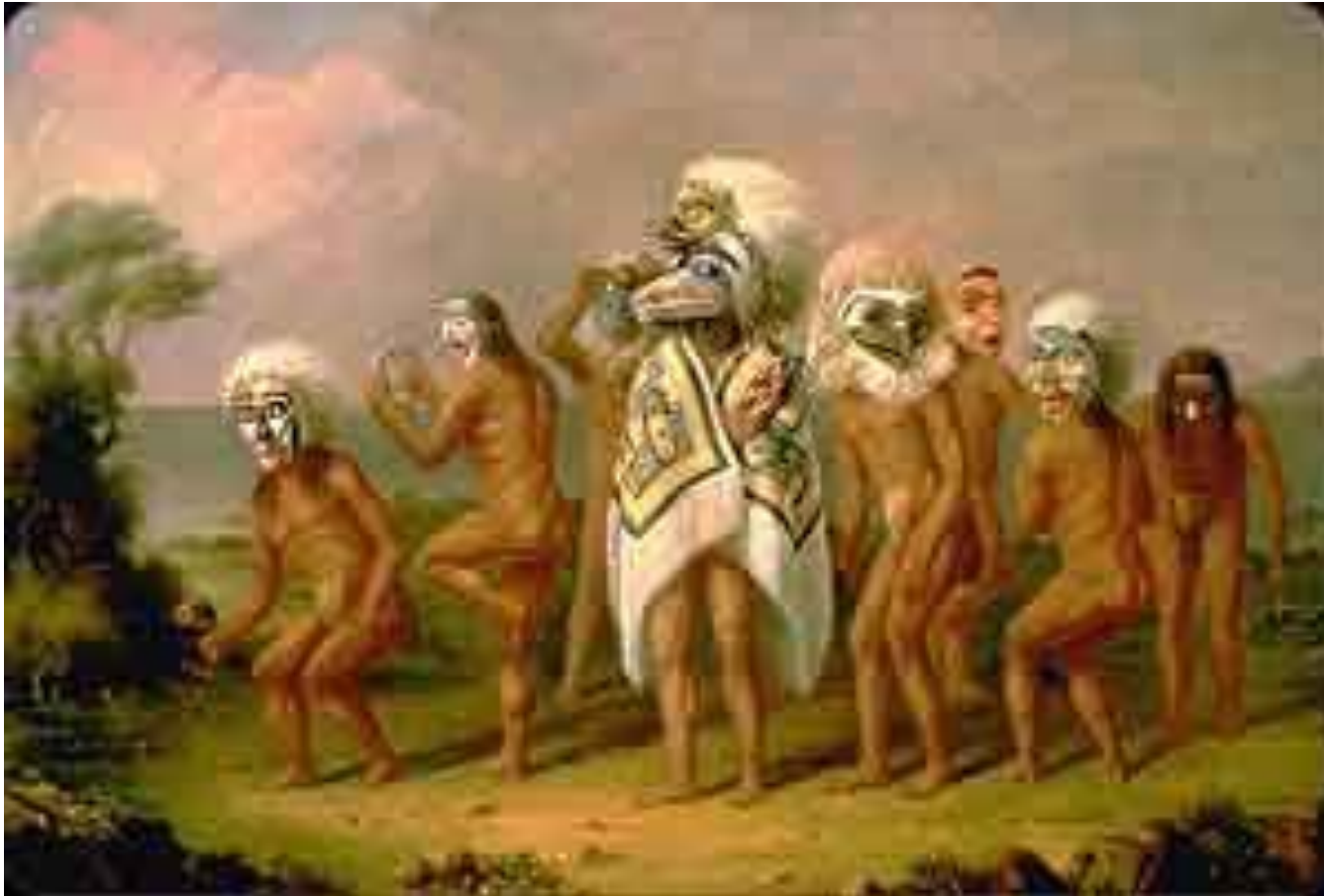
Medicine Mask Dance

Paul Kane