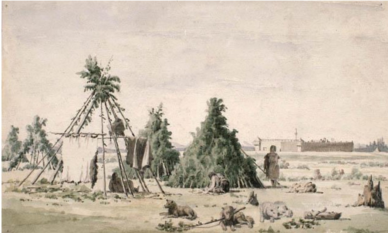
Cree or Assiniboin Lodges in Front of Rocky Mountain Fort, April 1848

Paul Kane