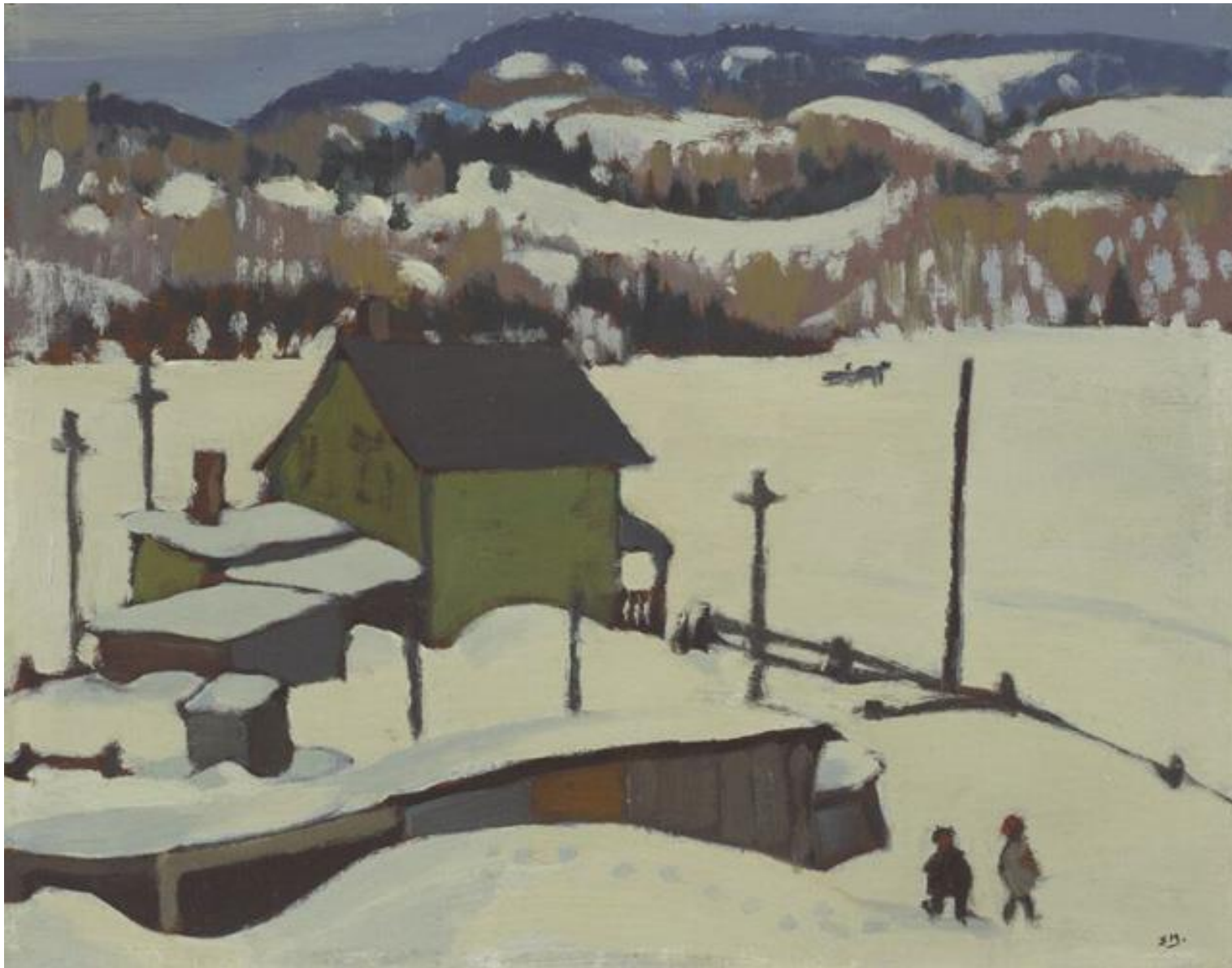
Winter Landscape , Available from Artefacts Canada

Edwin Holgate Diane Wolford Sheppard © 2104 – All Rights Reserved