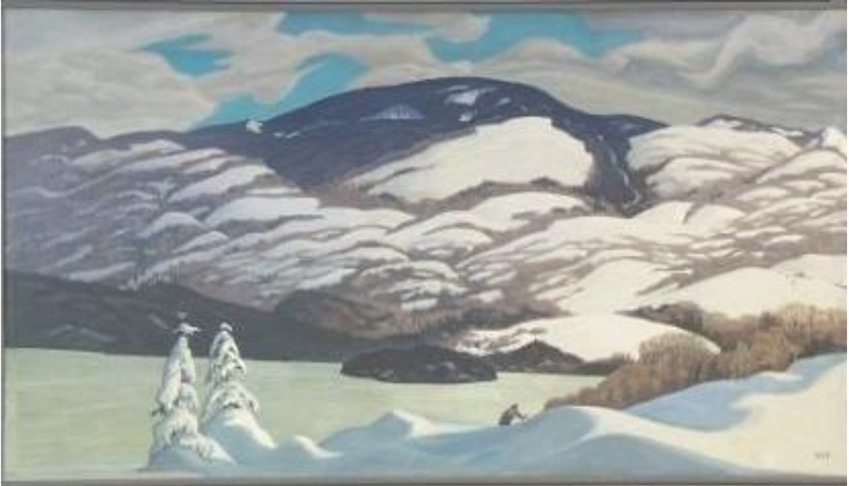
Untitled, 1954, Available from Artefacts Canada

Edwin Holgate Diane Wolford Sheppard © 2104 – All Rights Reserved