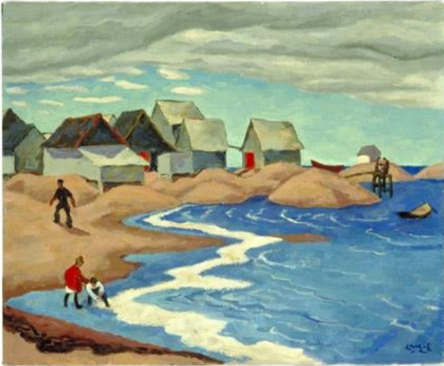
Fisherman's Houses , circa 1933, Available from Artefacts Canada

Edwin Holgate Diane Wolford Sheppard © 2104 – All Rights Reserved