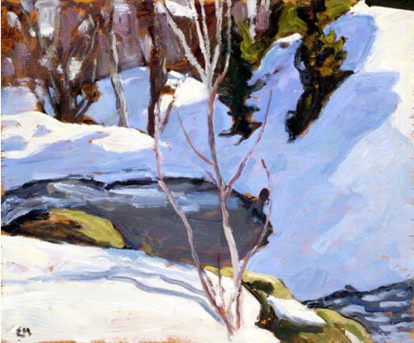
The Pool , Available from Artefacts Canada

Edwin Holgate Diane Wolford Sheppard © 2104 – All Rights Reserved