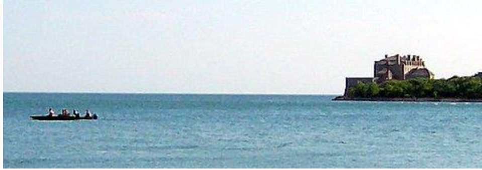
2007 (Thanks to Al Trudeau for cropping this photo)