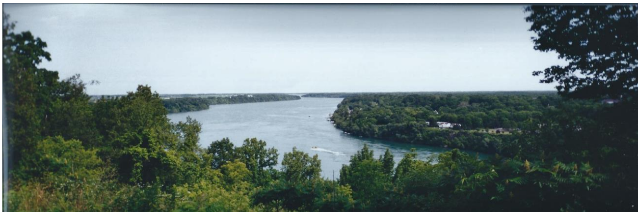
Niagara River flowing toward Lake Ontario, 2001