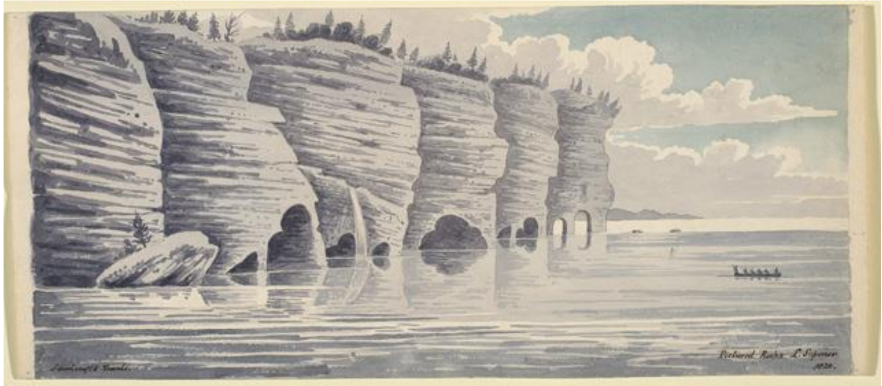
Pictured Rocks, Lake Superior, 1820

Charles Ramus Forrest Diane Wolford Sheppard © 2014 – All Rights Reserved