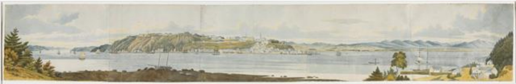
Cape Diamond and Quebec from Point Levy

The following representative paintings were accessed from Artefacts Canada: http://www.rcip-chin.gc.ca/bd-dl/artefacts-eng.jsp?emu=en.artefacts:/ws/human/user/www/SearchForm&searchType=advanced&currLang=English . Enter the name of the artist in the “who box” and then chose how the results are displayed.