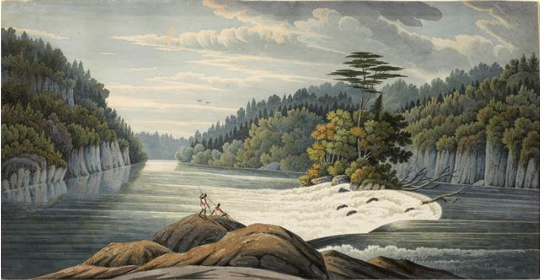
Sault au Récollet, French River, Lake Huron

Charles Ramus Forrest Diane Wolford Sheppard © 2014 – All Rights Reserved