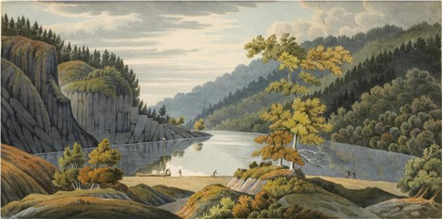
Grand Campment, French River, Lake Huron

Charles Ramus Forrest Diane Wolford Sheppard © 2014 – All Rights Reserved