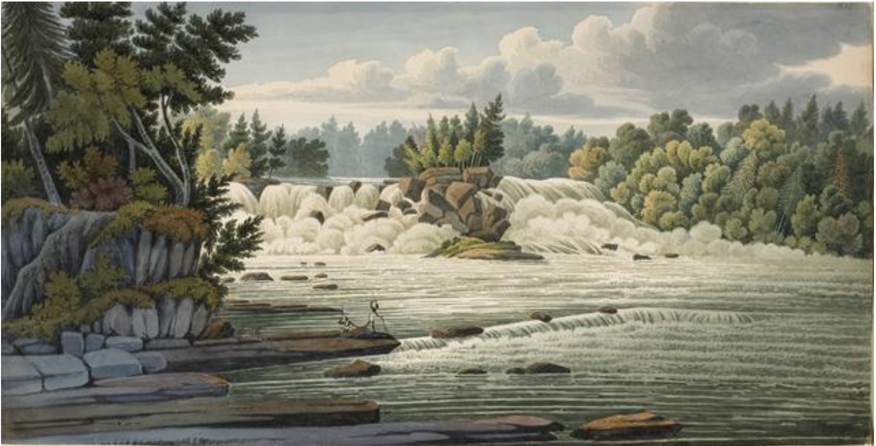
Chat Falls, Lake Chaudière on the Ottawa