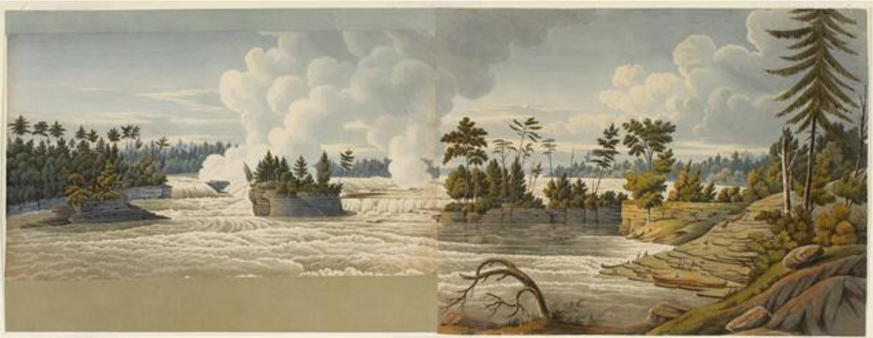
Chaudière Falls, Ottawa River