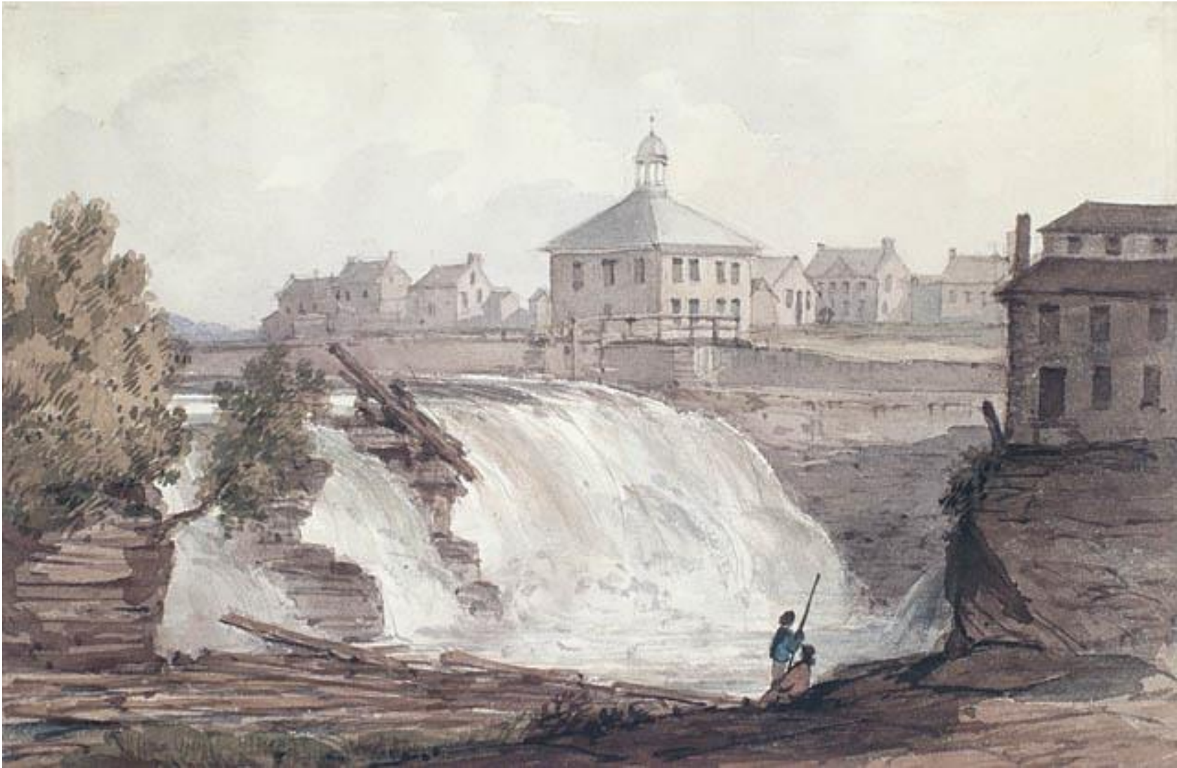
Part of the Chaudiere Falls from Hull, December, 1851