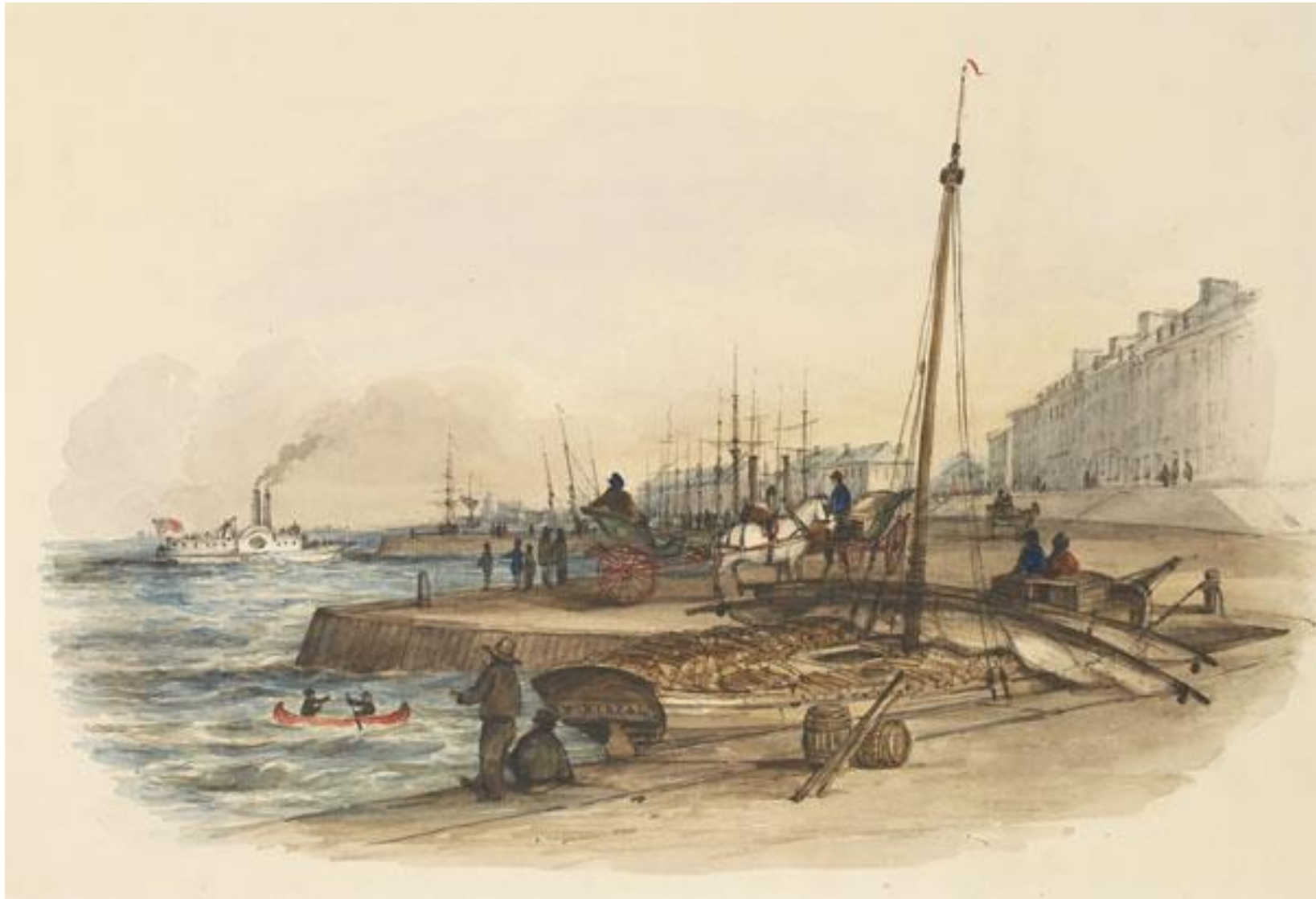
Montréal waterfront and docks, 1847-1850