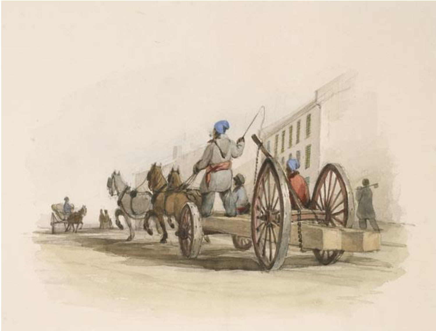
Carting square timbers, 1847-1850