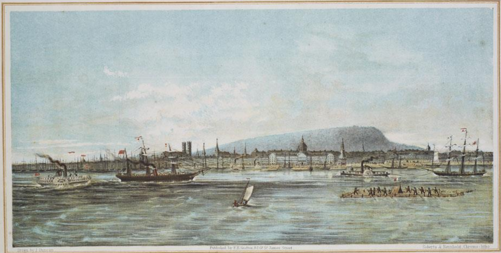
City and Harbour of Montréal.