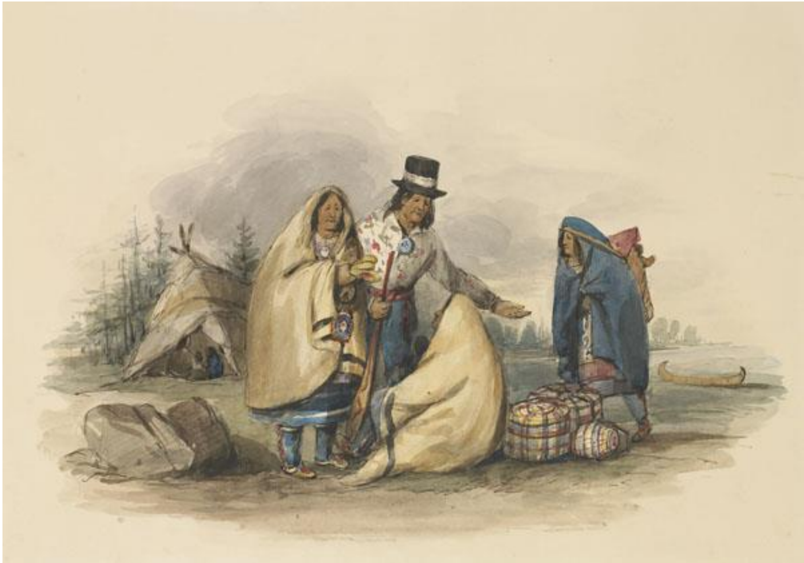
Indian group, 1847-1850