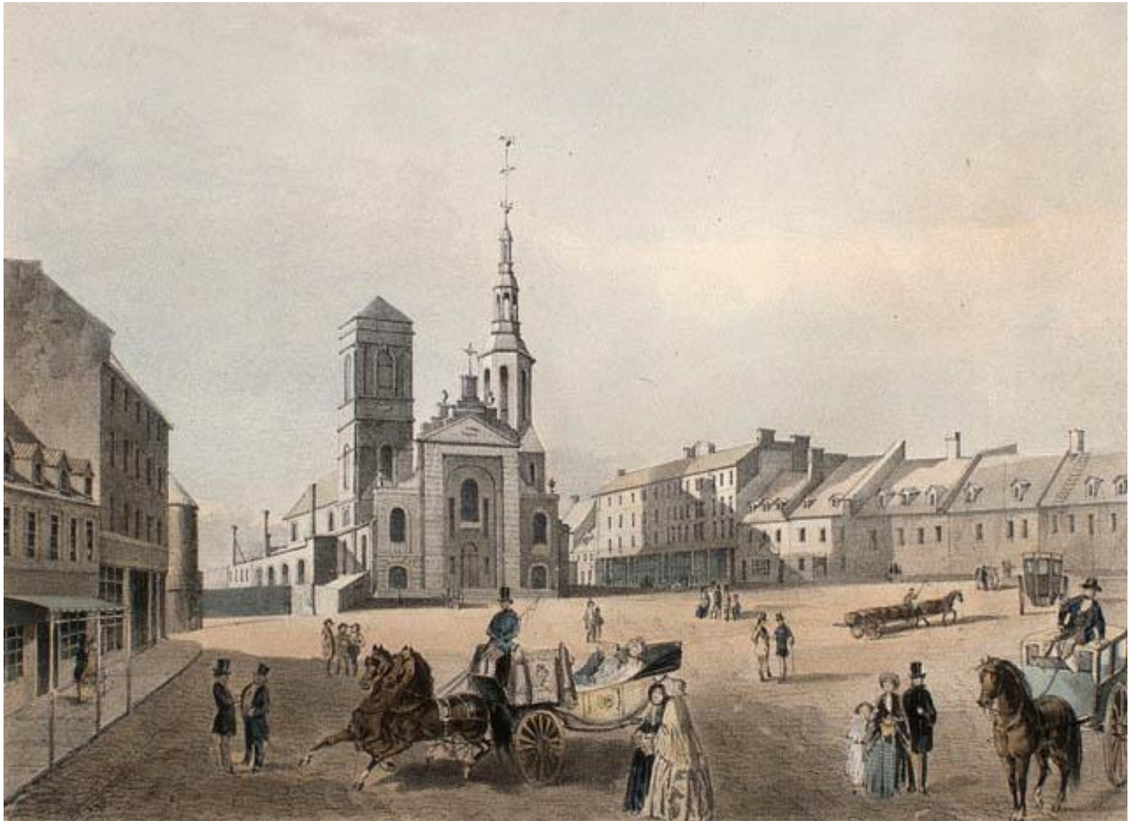
French Cathedral and Market Square, Quebec City, Mikan # 2837622