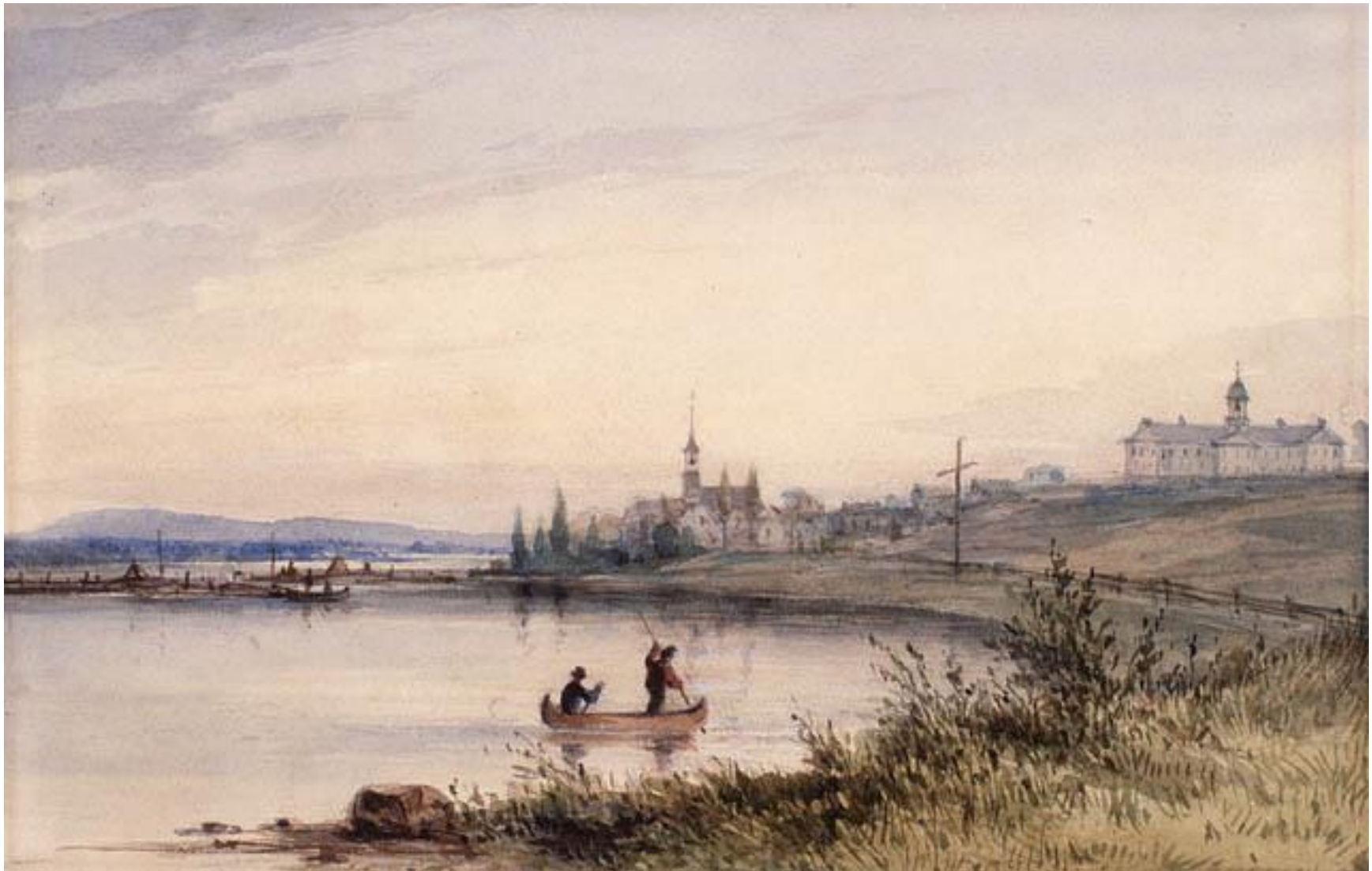
View of a town on the north shore of the Ottawa River, circa 1840