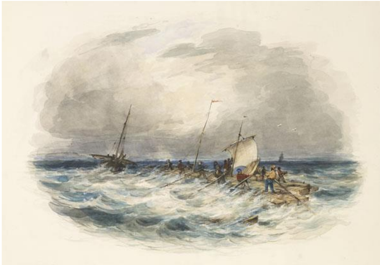
Lumber raft in storm, 1847-1850

The following representative paintings are available from Library and Archives Canada: http://www.collectionscanada.gc.ca/lac-bac/search/images .