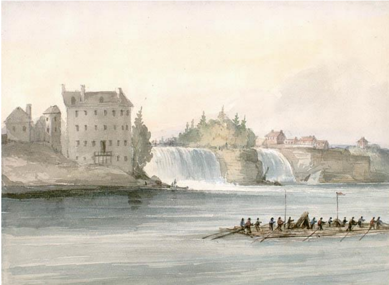
Rideau Falls at Bytown, Canada West, circa 1851