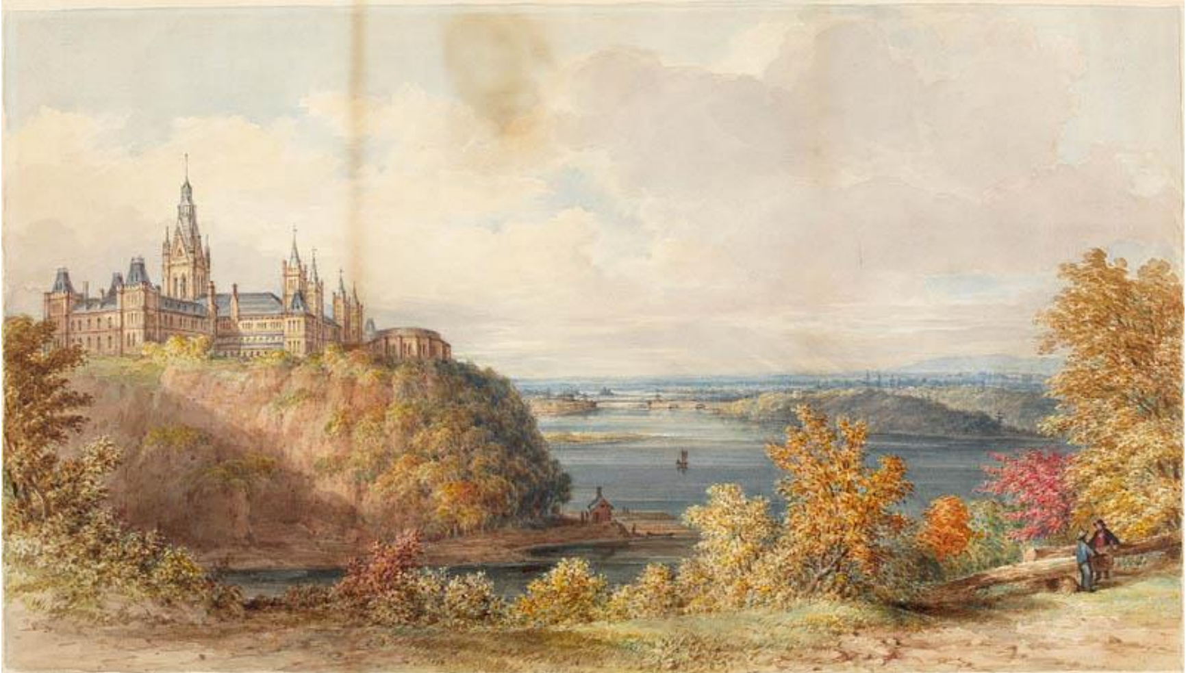
Parliament Buildings, Ottawa, circa 1866