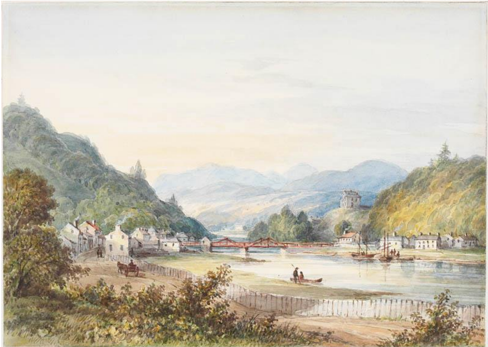
Landscape with a Settlement and a Bridge , after 1830, Mikan # 2838346, Library and Archives Canada, Acc. No. R9266-179 Peter Winkworth Collection of Canadiana