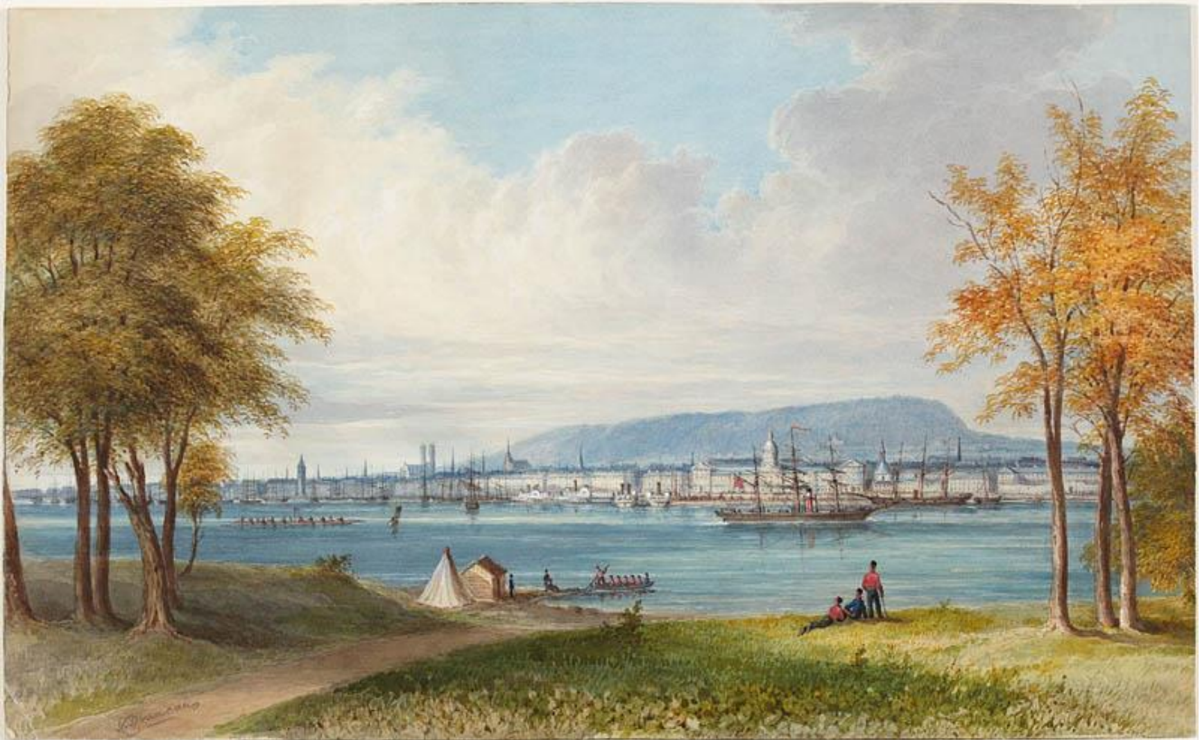
Montreal from St. Helen's Island, circa 1860, Mikan # 2838053