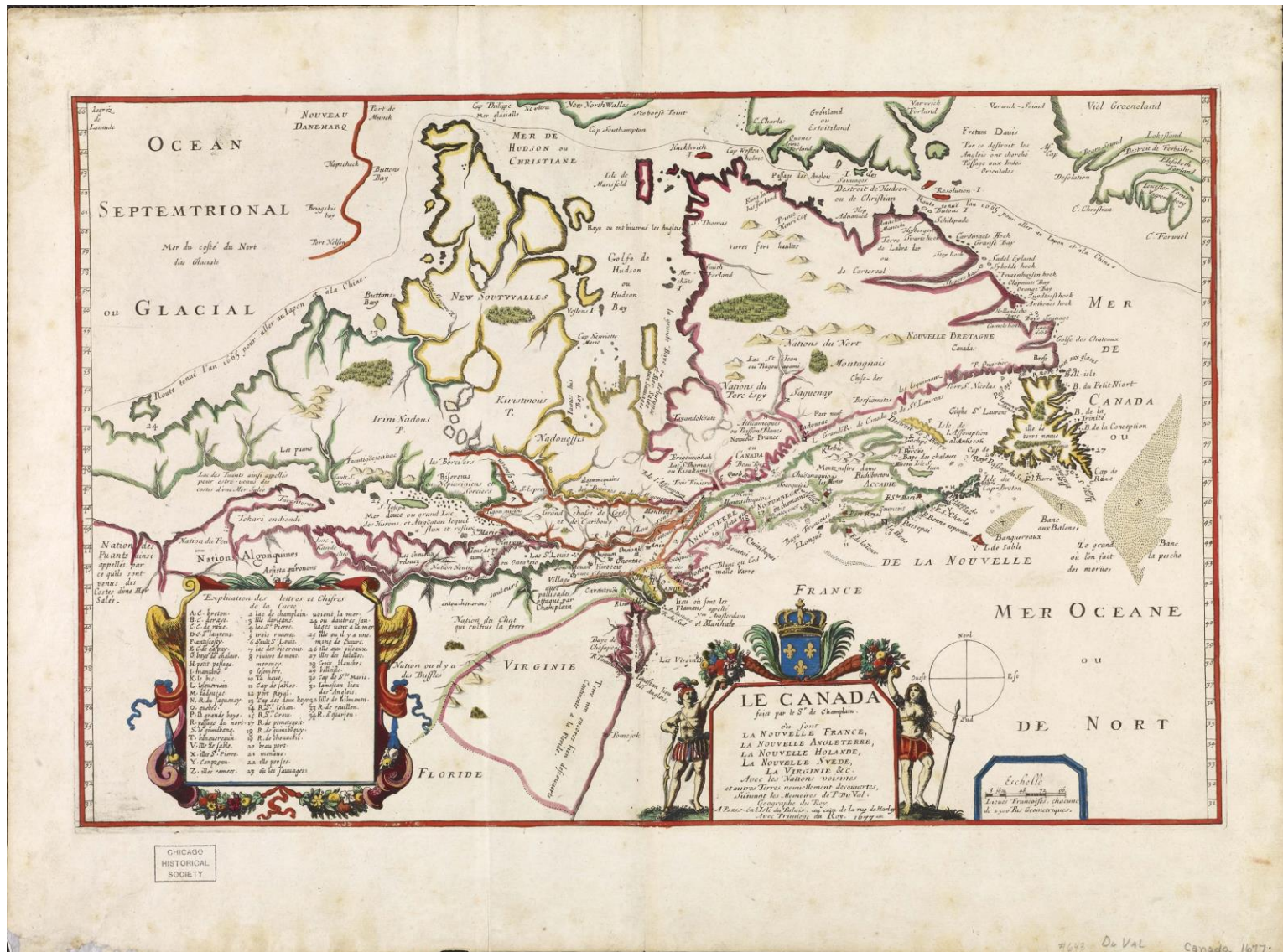
Pierre Du Val – 1677 – Le Canada fait par le Sr de Champlain : où sont la Nouvelle France, la Nouvelle Angleterre, la Nouvelle Hollande, la Nouvelle Suede, la Virginie &c. avec les nations voisines et autres terres nouvellement decouvertes, suivant les memoires de P. du Val, geographe du roy