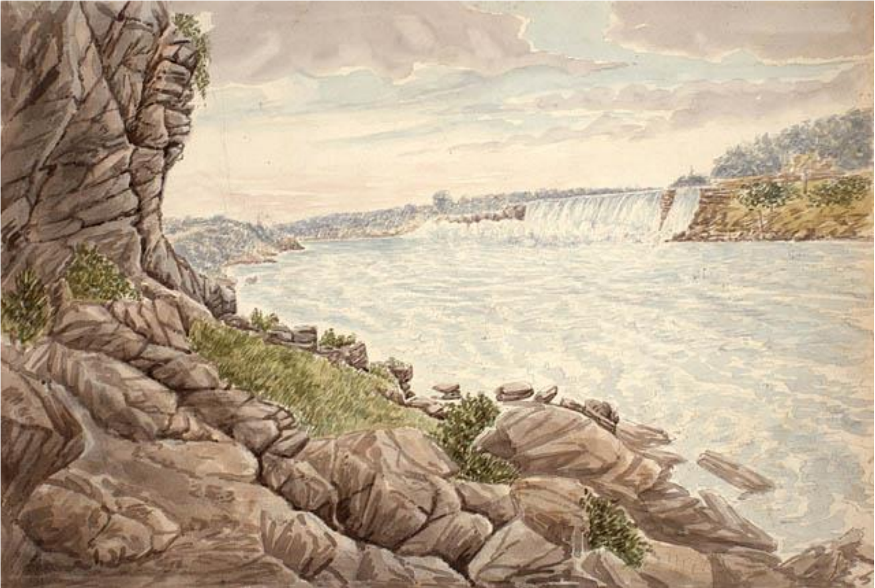
American Falls, Niagara from the Canadian Side, circa 1830, Mikan # 2836195