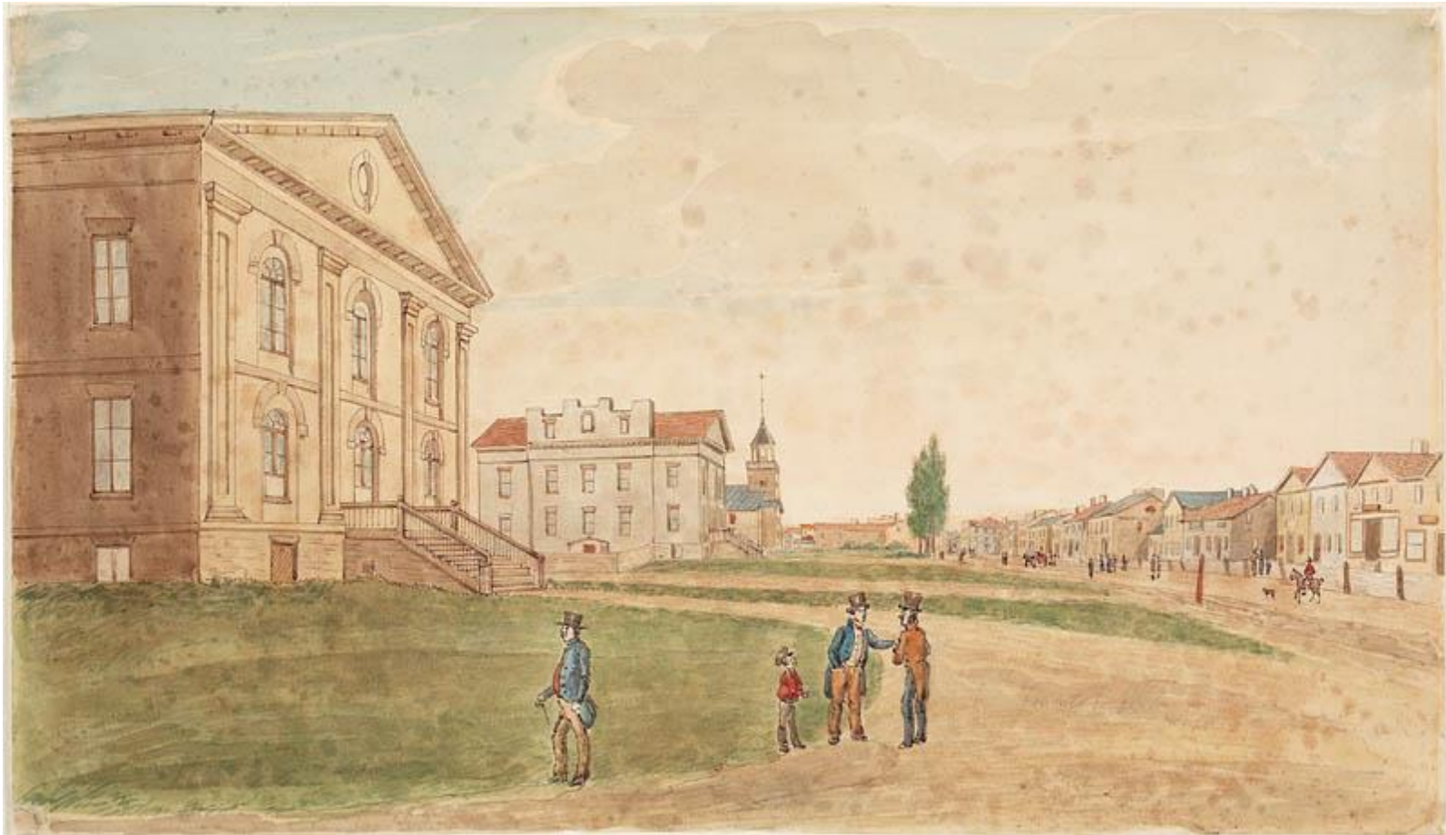
Toronto or York, capital of Upper Canada, showing Court House and Jail, August 1829, Mikan # 2838145, Library and Archives Canada, Acc. No. R9266-142

You can read James Cockburn’s biography at http://www.biographi.ca/en/bio/cockburn_james_pattison_7E.html . The following representative paintings are available from Library and Archives Canada: http://www.collectionscanada.gc.ca/lac-bac/search/images .