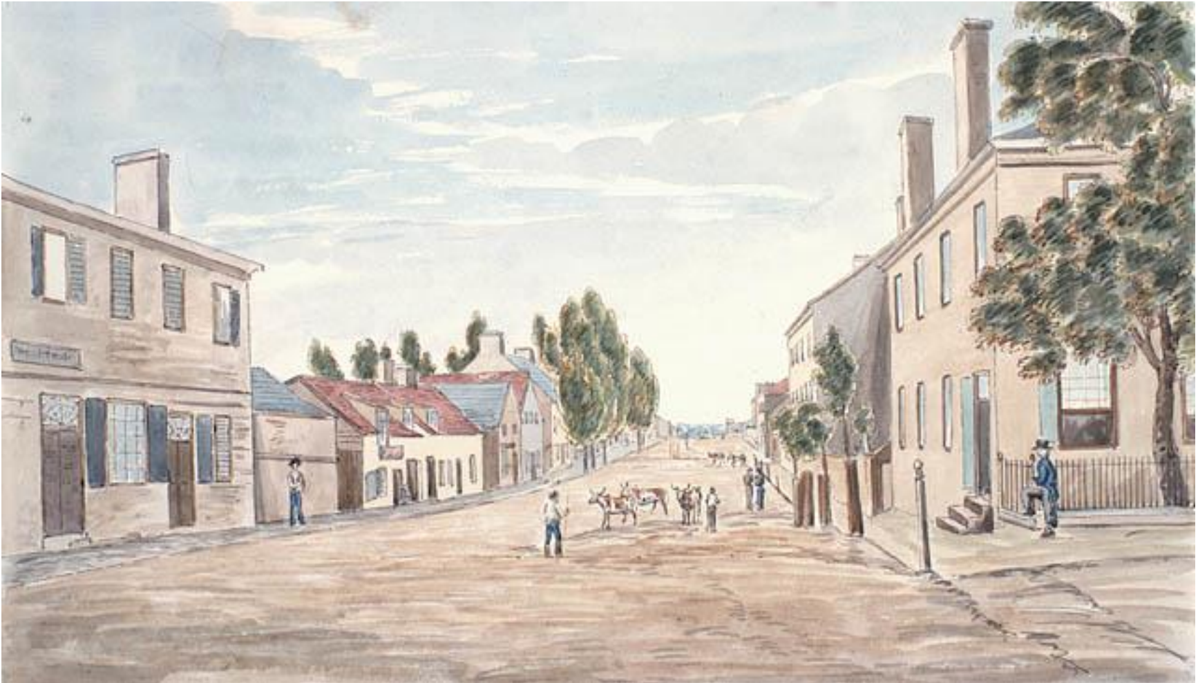
Street Leading to the Barracks at Kingston, Upper Canada, 1829, Mikan # 2836354, Acc. No. 1970-188-971