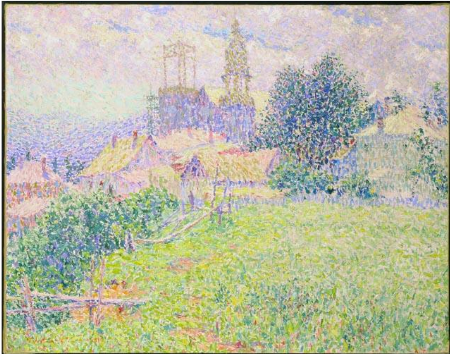
The New Church