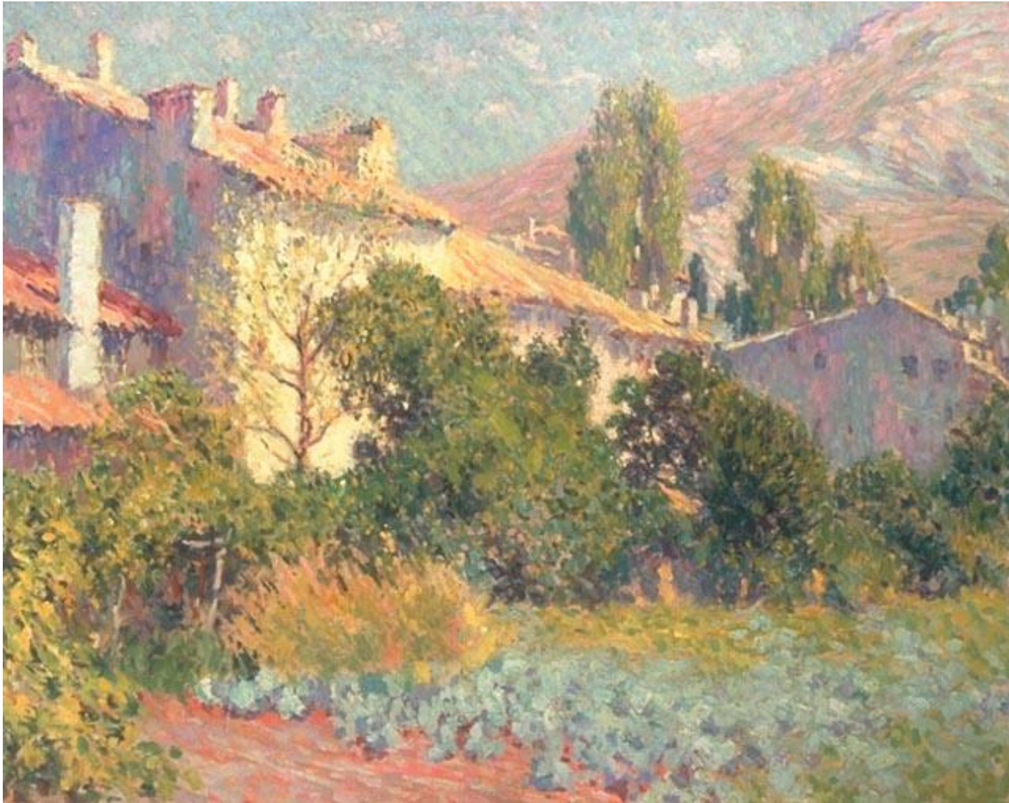
Morning in Spain , Available from Artefacts Canada