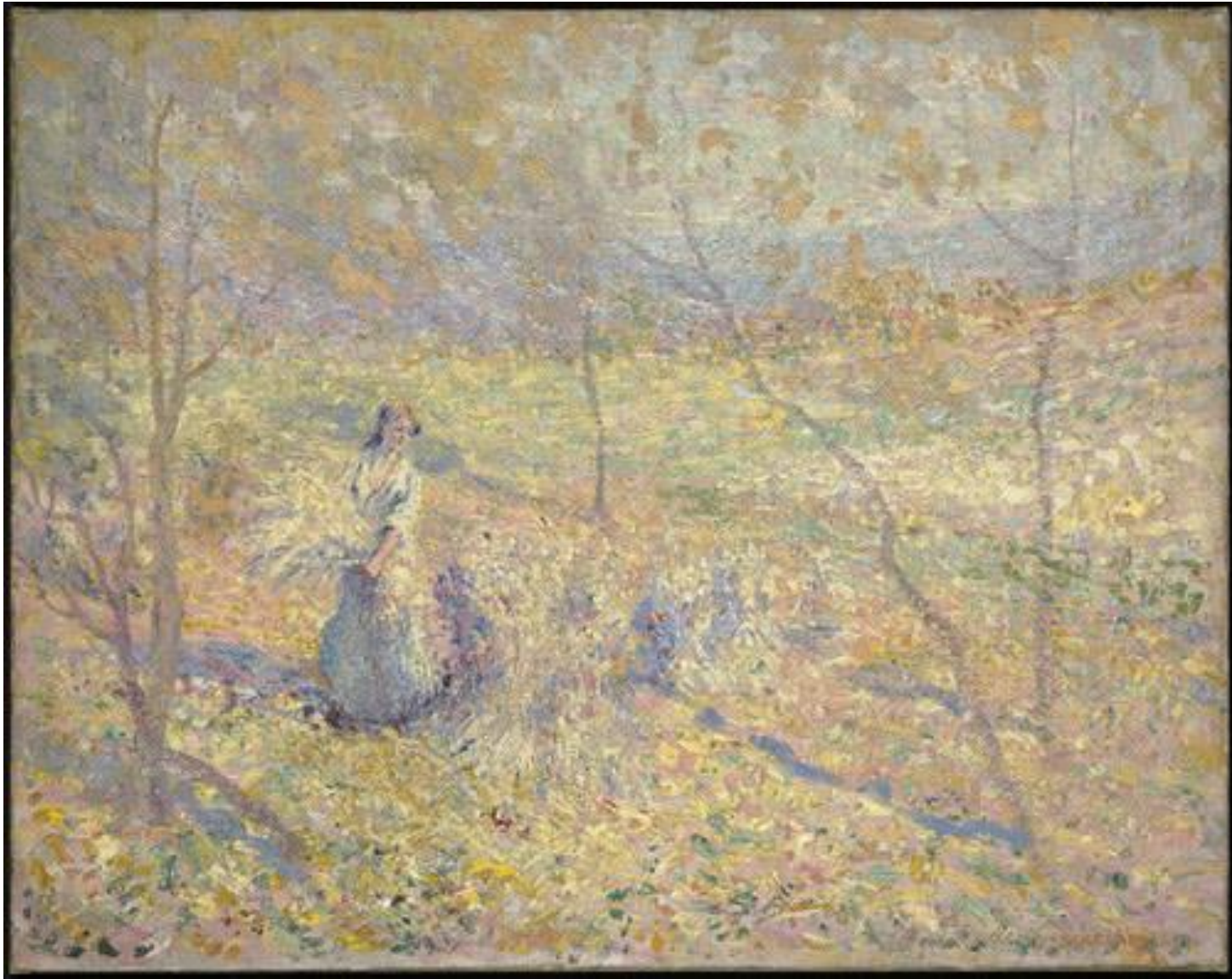
The Harvest, 1908-1915