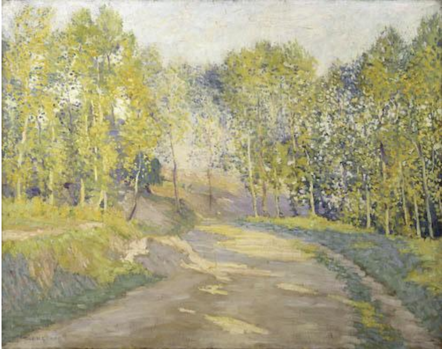
Spring, 1908-1915