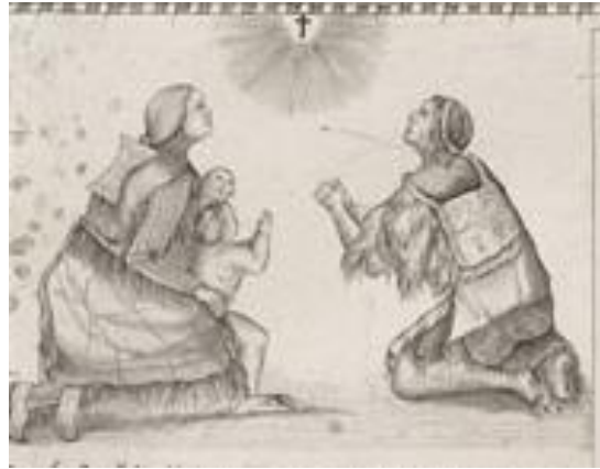
Detail from: Novae Franciae accurata delineatio 1657 (see the following page for the full citation)

While François Joseph Bressani/Francesco Giuseppe Bressani, S.J., was en route to Huronia in 1644, he was captured by the Iroquois and tortured extensively, eventually losing all but one finger on his right hand. Following his adoption by an old Iroquois woman, she turned him over to the Dutch for a small sum. The Dutch treated him well and he was able to return to France; the following year he returned to New France and departed for Huronia in the fall of 1645. Bressani remained in Huronia until 1649, having made two trips to the St. Lawrence settlements to seek help from the Governor for the Huron who had been under attack from the Iroquois. Following the destruction of Huronia, the Jesuit superiors sent a number of missionaries back to France. After his return to France, Bressani wrote a relation of his time in New France, devoting most of the work to the Huron and the Jesuit martyrs. 1 Bressani also drew the map that follows after his return to Europe. The Jesuits used the map and illustrations as an education tool for later missionaries in New France. 2