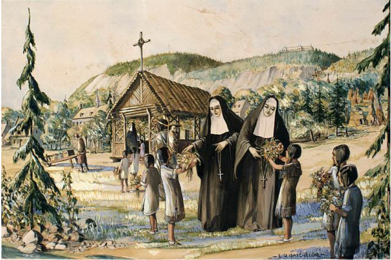
First Ursuline Nuns with Indian Pupils at Quebec – circa 1931 – Mikan # 2833440 - Acc. No. 1983-45-1 / C-010520

You can read Marie l'Incarnation's biography in the Dictionary of Canadian Biography Online at: http://www.biographi.ca/en/bio/guyart_marie_1E.html