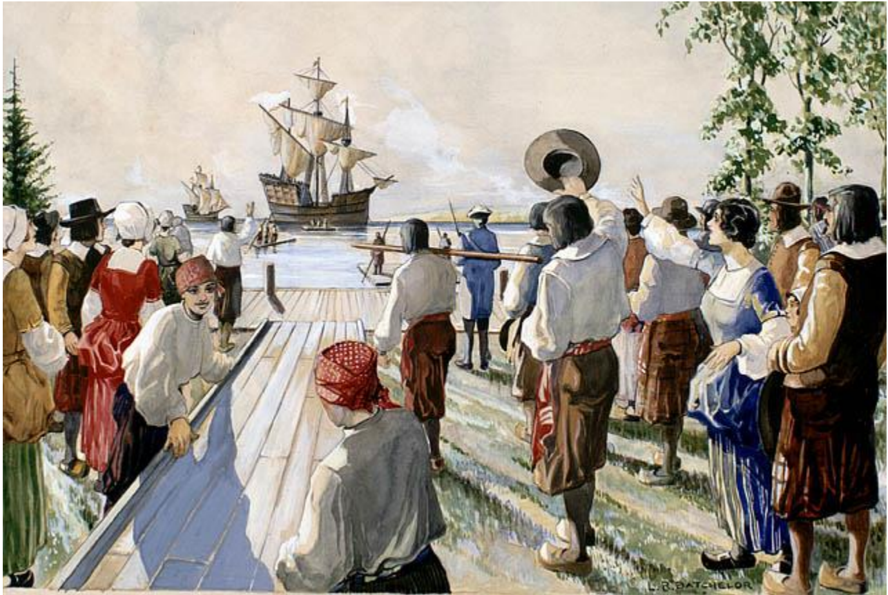
Arrival of Ships from France – circa 1931 – Mikan #2833441; Acc. No. 1983-45-2 / C-011924