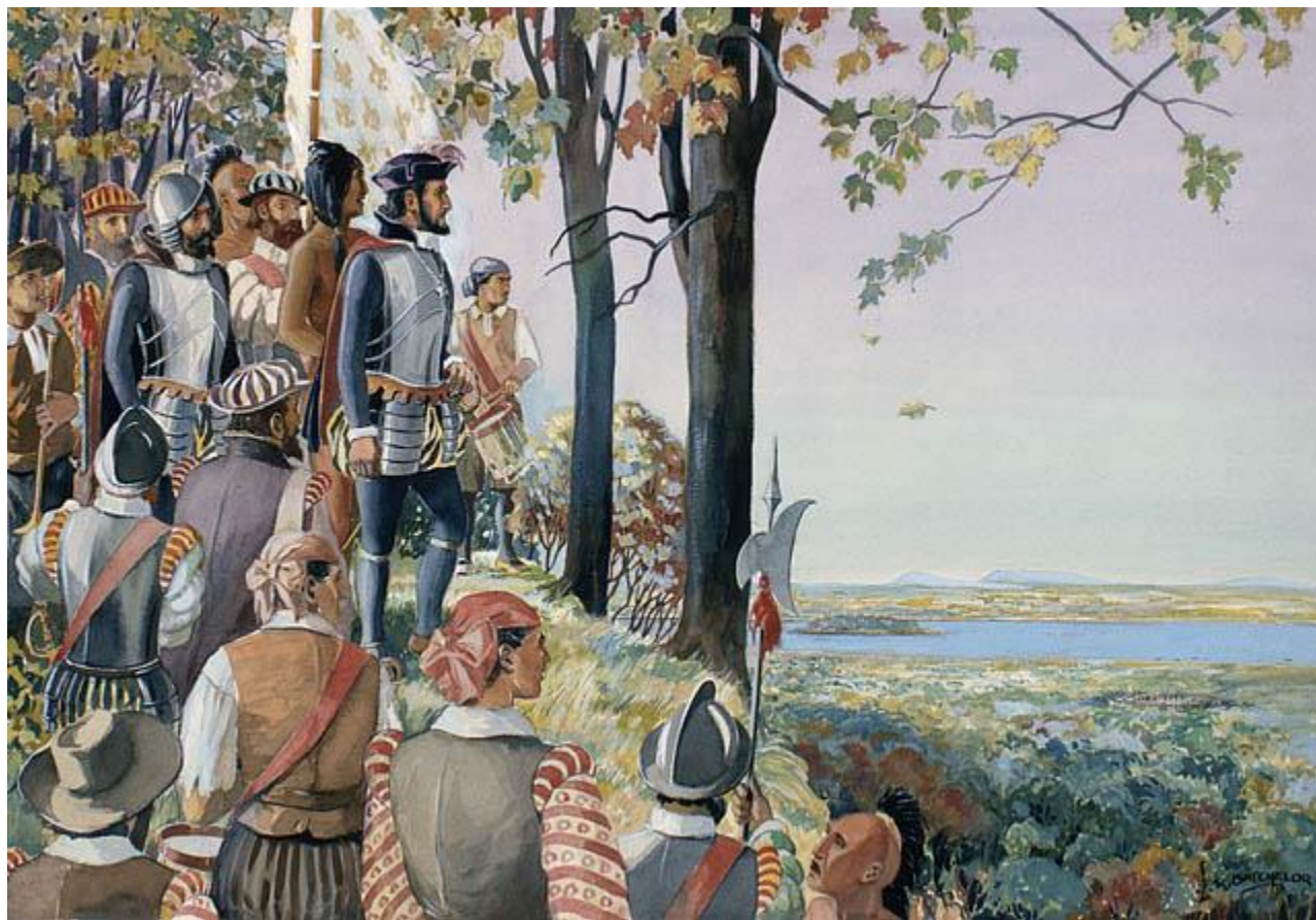
Jacques Cartier on Mount Royal - circa 1933; Mikan #2833444; Acc. No. 1983-45-6 / C-010521