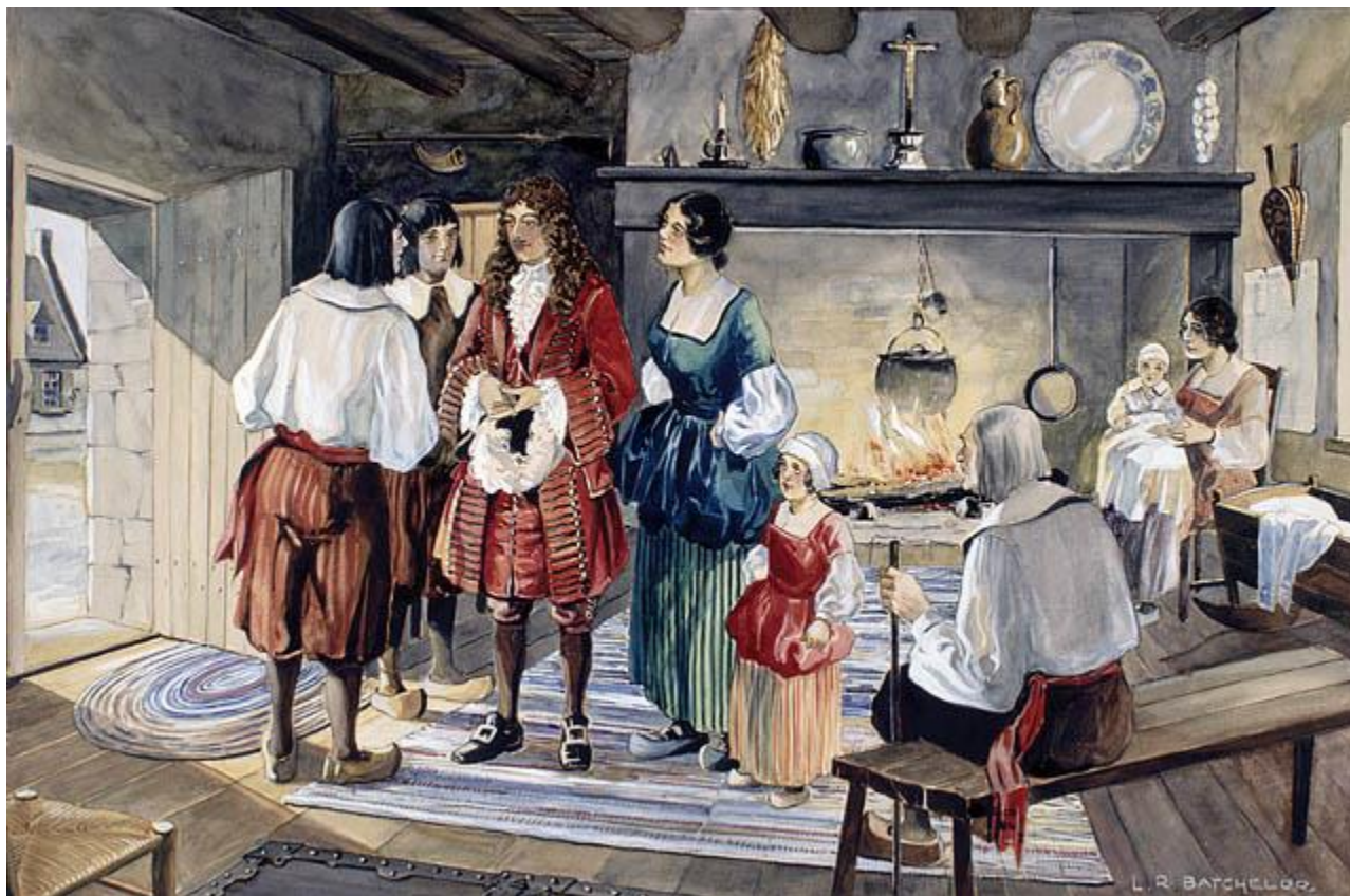
Jean Talon Visiting Settlers – circa 1931 – Mikan #2833442; Acc. No. 1983-45-3 / C-011925

You can read Jean Talon's Biography in the Dictionary of Canadian Biography online: http://www.biographi.ca/en/bio/talon_jean_1E.html