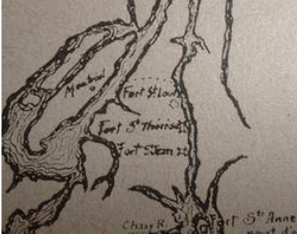
Carte des forts du Richelieu dressée en 1666 pour la campagne du Régiment de Carignan-Salières.

Map of Fort Chambly and other forts on the Richelieu River circa 1666 for the campaign of the Regiment of Carignan-Salières http://en.wikipedia.org/wiki/Fort_Chambly